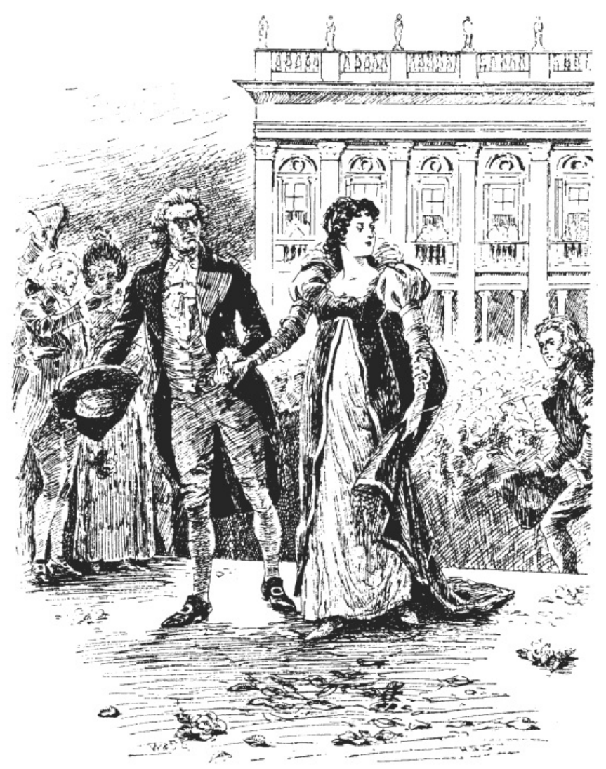
Corinne at the Capitol.

At length way was made through the crowd for the four white horses that drew the car of Corinne. Corinne was seated in this car which was constructed upon an antique model, and young girls, dressed in white, walked on each side of her. Wherever she passed an abundance of perfumes was thrown into the air; the windows, decorated with flowers and scarlet tapestry, were crowded with spectators; every body cried, "Long live Corinne!" "Long live Genius and Beauty!" The emotion was general but Lord Nelville did not yet share it, and though he had observed in his own mind that in order to judge of such a ceremony we must lay aside the reserve of the English and the pleasantry of the French, he did not share heartily in the fête till at last he beheld Corinne.