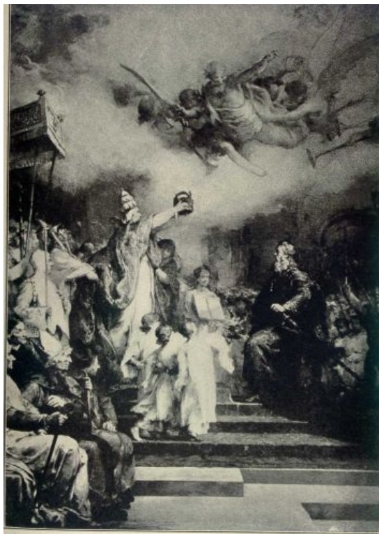
From the painting by Levy.