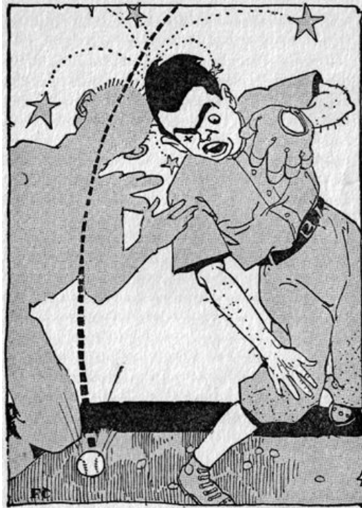
Shut their eyes going after a fly ball, their skulls came together and it sounded like a freight wreck (p. 20).