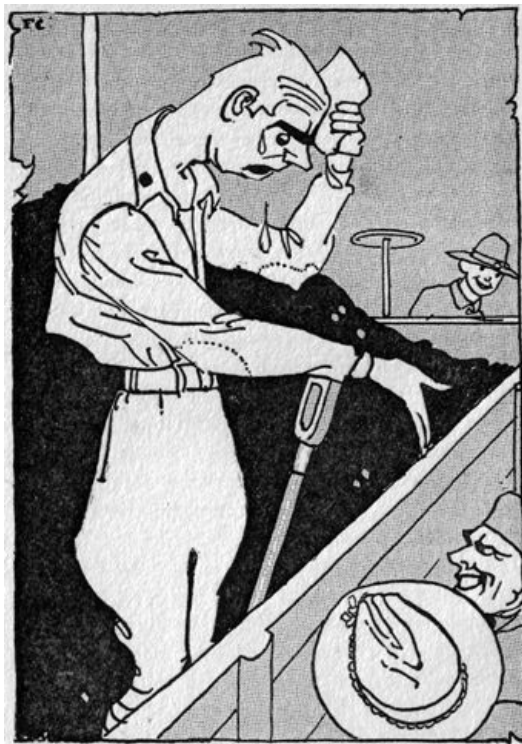
He objected to being a soldier, so Capt. Nash asked him if he would object to unloading a few cars of coal (p. 39).

Well Al he has got a sweet chance to catch me outside of the camp because when he is outside of the camp I will be inside of the camp and I am glad I found out the truth about both he and Castle and now maybe I can get some sleep.