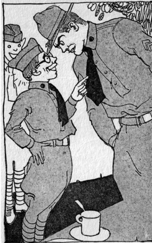
Corporal don't carry no arms of any kind and all he is is a kind of decoy to kep the Germans shooting (p. 91).

Well anyway we won't have to practice fighting no more with broom sticks and cans and etc. because Sargent James told us tonight that the rifles was comeing so I said to my boys that I hoped they was good shots so we could make a sucker out of the other squads and I told them if they was all as good a shot as me I wouldn't have no kick because I figure that anybody thats got as good control when they throw or pitch should certainly ought to shoot straight. So Red Sampson says that if I was in the French army it wouldn't do me no good to be a crack shot and I asked him why not and he says the corporals in the French army are not allowed to carry no guns but all they was supposed to do was run ahead of the privates and draw the fire and maybe if the Germans happened to not hit them they could pull out their scissors and cut the bob wire untanglements so as the privates wouldn't have no trouble getting in to the German trenches where they could use their bayonets.