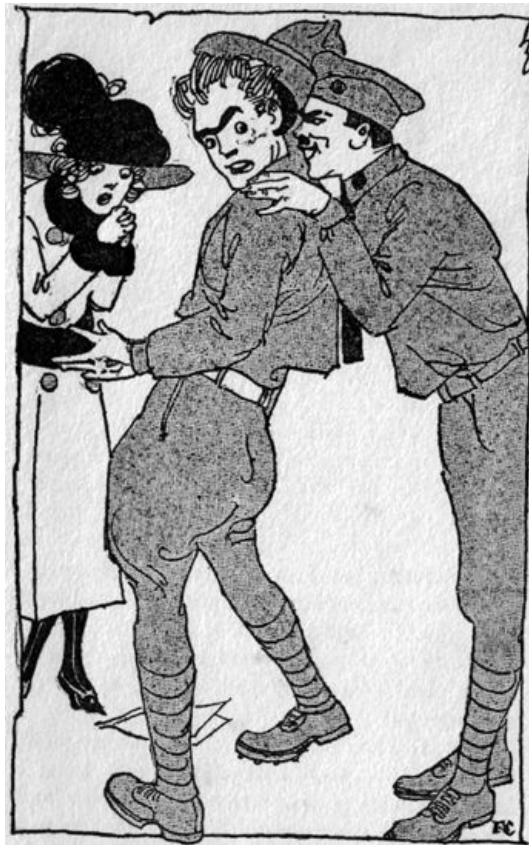
Well if here ain't old Jack Keefe (p. 154).

Well Al Florrie come up and kissed me right in front of the whole hotel and the next thing I know the 3 of us was away from Kramer and the dame and Florrie was telling me how she had came down to give me a Xmas supprise and she is going to stay about 3 wks. and spend some of the time with her sister over in Beaumont.