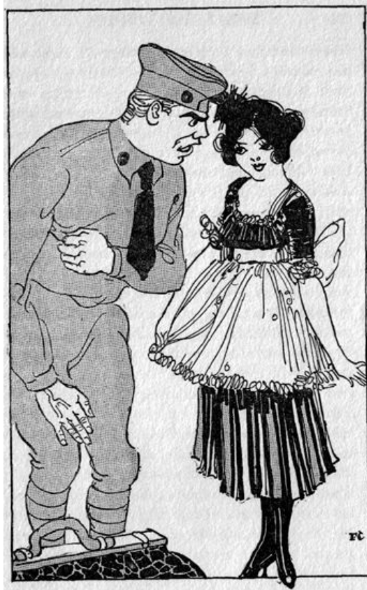
One of the girls there told me Florrie was taking the P.M. off (p. 130).

Well Al I won't get no more leave off till Xmas and maybe not then but what is the use any way when your wife gives you a welcome like that and all together it was a fine trip and I won't never try and take nobody by surprise after this but at that why couldn't she of stayed home where a woman belongs.