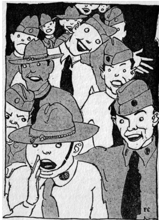
Everybody cut loose and sung and you could of heard us in Beloit.

I thought once or twice today that I would just drop her a card pretending like the sox fit me to a tea and thanking her for them and giving a hint that I was a married man but on second thoughts I guess its better to just let the whole affair drop right here.