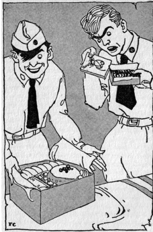
I didn't feel so sorry for him when we opened the boxes they had brought us (p. 65).