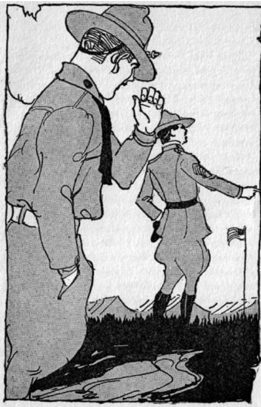
If he can get a sargent I will be a gen. in a month (p. 147).