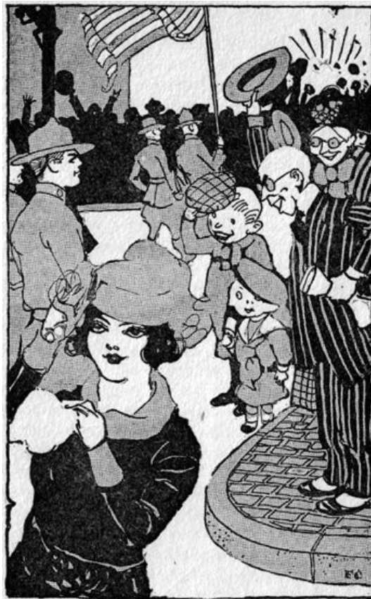
As we marched, everybody stood on the side walks and cheered us to the ecco (p. 129).

So I went back to the flat and looked for the janitor to let me in and when you don't want janitors they are always snooping around at your coat tails but when you do want them they are hideing in the ash bbl. or something. So it took me about a hour to find this bird and another hour to get him to open the door up for me and of course they wasn't nobody home so the janitor says maybe I could find out where they went from the neighbors so I rung the woman across the hall's bell and she come to the door. So I said "I'm Corp. Keefe and I wanted to know if you knew where is my wife and kid." So she says "They went out." Well Al I suppose I didn't know they had went out and I felt like saying to her "Oh I thought they might maybe of crawled in between the wall paper to take a nap or I thought maybe they might of left the stopper out of the bath tub and got drained off or something." But I just asked her did she know where they went and she said she didn't.