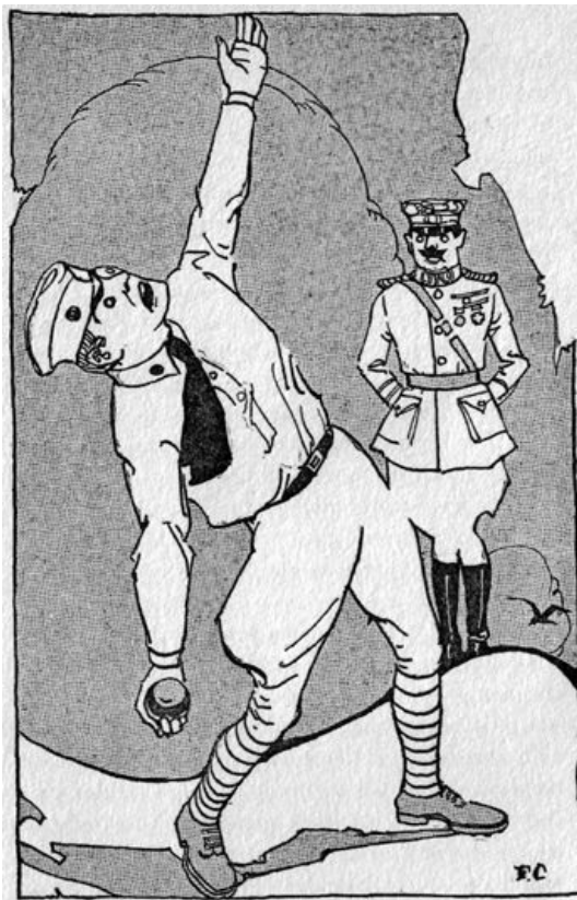
The way he threw bombs he couldn't of took a baseball and hit the infield from second base (p. 77).

I have all ready wrote and told Florrie about it and I bet she will go crazy when she reads my letter and after this when they call her Mrs. Keefe she can shrink up her shoulders and say "Mrs. Corp. Keefe please" and you will have to salute when you see me Al. Of course I mean that for a joke because what ever honors I get I wouldn't leave them make no difference in our friendship and betwen you and I it will always be just plain Jack Keefe.