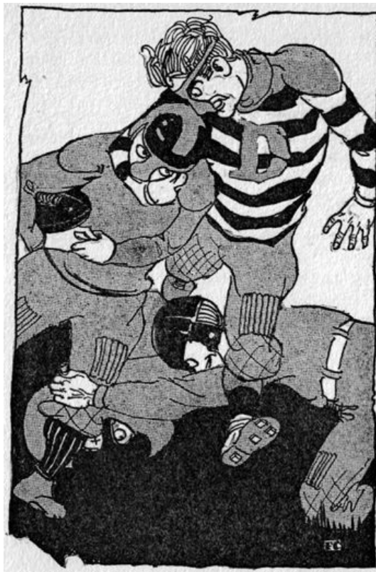
5 or 4 of us bumped into each other and I got a kick in the head (p. 117).

Capt. Whiting come up to me when I come out on the field and asked me my name and etc. and what position did I play and I told him center rush or tackle back it didn't make no difference. So he asked me what college I played at and I told him Harvard which was the 1st. thing that come into my head. So he says "All right we need a good tackle back so you can play there now in signal practice" so they lined up and I stood back of the center rush and they called out some numbers and threwed the ball to one of them and 3 or 4 of us bumped into each other and fell down and I got a bad kick in the head but it wasn't bad enough to make me quit but what is the use of takeing chances. They can have their football Al if they want to waist the govt. time but I got enough to think about thinking about winning this war.