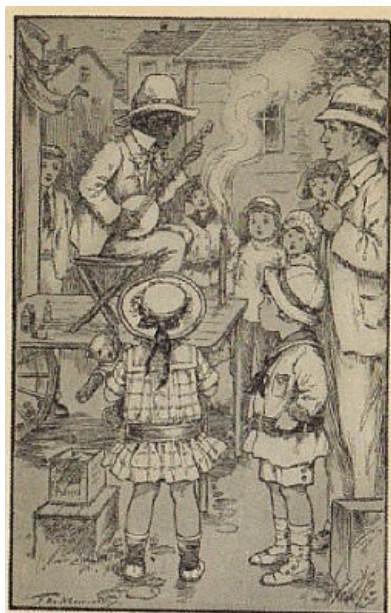
"NOW TAKE A GOOD LOOK," WHISPERED SUE TO BUNNY. Bunny Brown and His Sister Sue on an Auto Tour. Page 153.

"Yes," and Mr. Brown smiled. "I want to know if he is Fred Ward, who has run away from his home next door to us?"