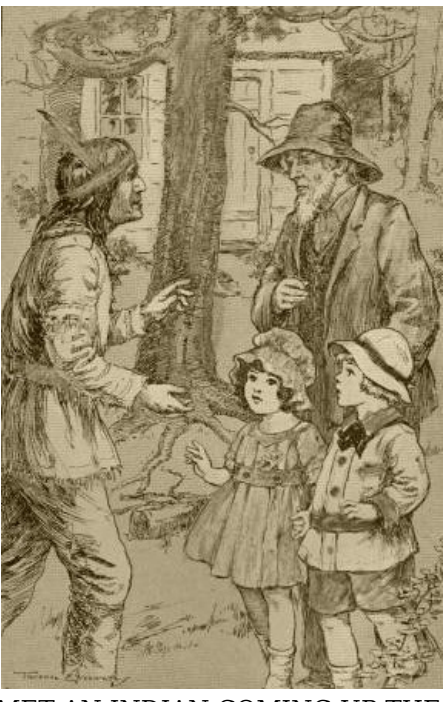
THEY MET AN INDIAN COMING UP THE PATH. Bunny Brown and His Sister Sue in the Big Woods. Page 129.

Together the children and their dog walked on along the road, and Splash went on so far ahead and so fast that often Bunny and Sue had to run to catch up to him.