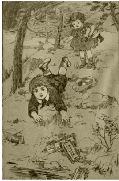
"I GUESS IT'S ROLLING FASTER THAN I AM," THOUGHT BUNNY. Frontispiece. Page 61 Bunny Brown and His Sister Sue in the Big Woods.