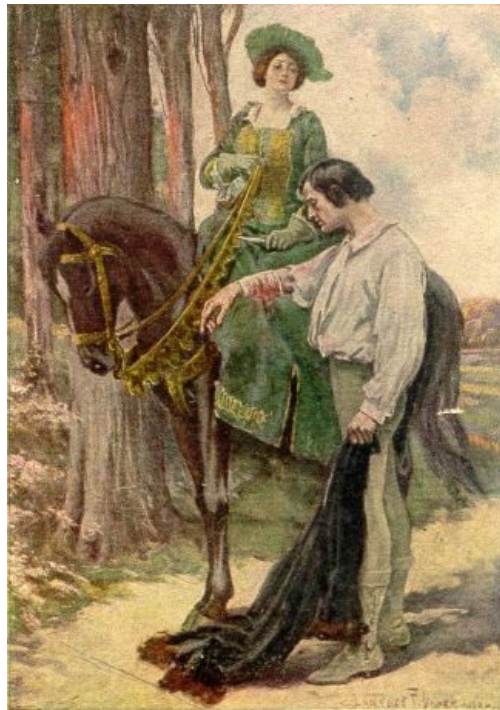
[Illustration: Cover art.]

*** START OF THE PROJECT GUTENBERG EBOOK BEATRIX OF CLARE ***