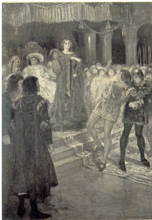
THE COUNTESS RAISED HER HAND AND POINTED AT HIM. Page 35

[Frontispiece: The Countess raised her hand and pointed at him.]