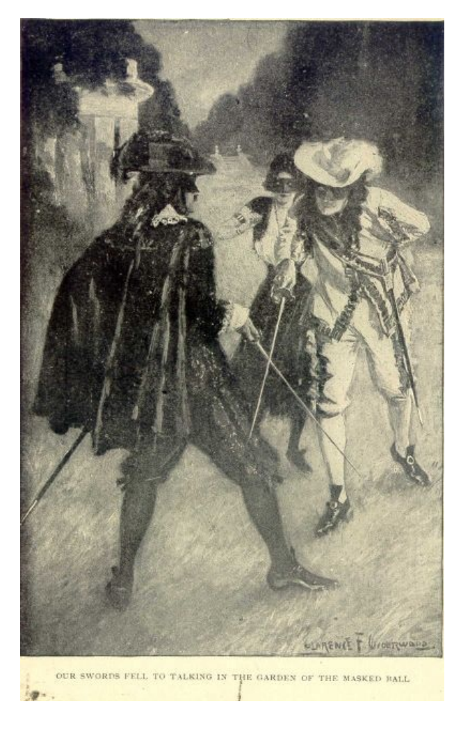
[Illustration: Then our swords fell to talking in the garden of the masked ball.]

The turf was free of brush or trees; and, as I have already said, the illumination was so arranged that, practically, there were no shadows. The Garden seemed almost as bright as day; indeed, save that the light was white, we might, just as well, have been duelling at noon-tide as at midnight.