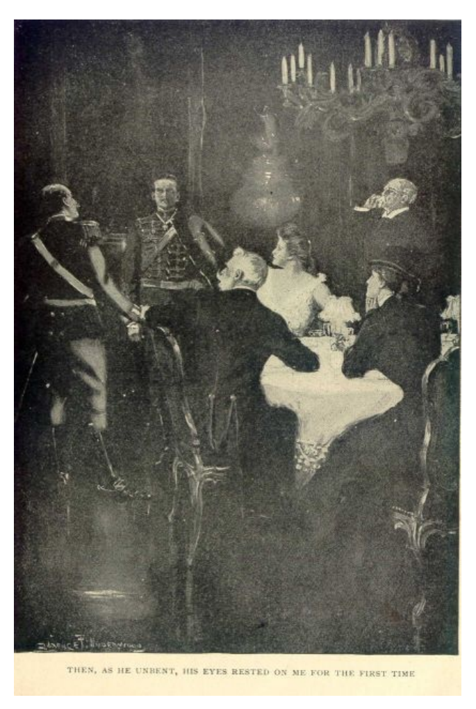
[Illustration: Then, as he unbent, his eyes rested on me for the first time.]

When he had greeted the King, and spoken to Lady Helen, he turned and, with eyes on Dehra, came toward us. Courtney and I arose and stepped back. The Princess swung around in her chair and gave him her hand, but without a word of welcome—and he spoke none. Then, as he unbent, his eyes rested on me for the first time.