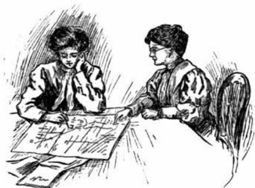
"SHE AND MISS BARBARA PORED OVER A MAP OF WASHINGTON."

The first week of Judith's visit in Packertown fairly flew by. Miss Barbara was away much of the time, both morning and afternoon, with her music pupils, but Judith busied herself with the making of the dainty white dinner gown, and wove happy day-dreams while she worked. In the evenings she and Miss Barbara pored over a map of Washington until they could locate all the prominent places of interest, and then Miss Barbara brought out a pile of borrowed magazines in which were interesting descriptions of those very places, and they took turns in reading aloud.