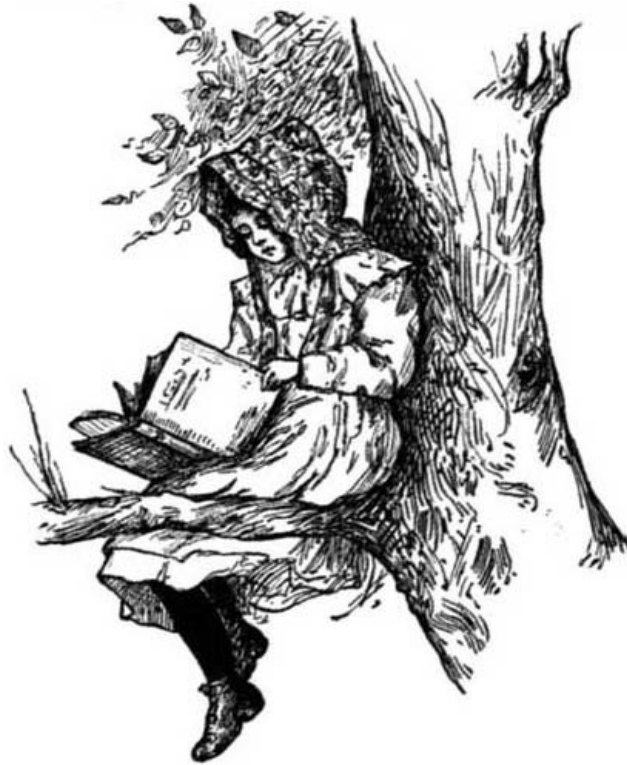
"SAT PERCHED AMONG ITS GUARDED BRANCHES."

"But, Ann," came the voice after a moment's waiting, "it is nearly sundown, and you ought to go right away, dear. Lottie says that you have been reading ever since you came home from school, and I am afraid that your mother wouldn't like it."