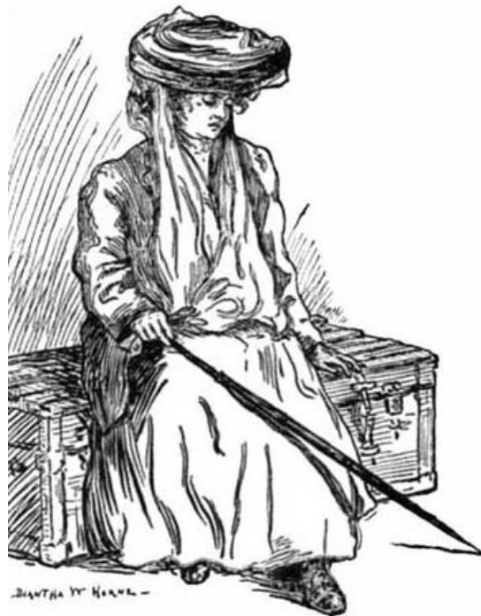
"SAT DOWN ON THE BATTERED LITTLE BOX TO WAIT."

She was groping in her pocket for a handkerchief to stop the tears that would come, despite her brave efforts to wink them back, when some one spoke to her. It was the pretty college girl whom the others had called Muffit.