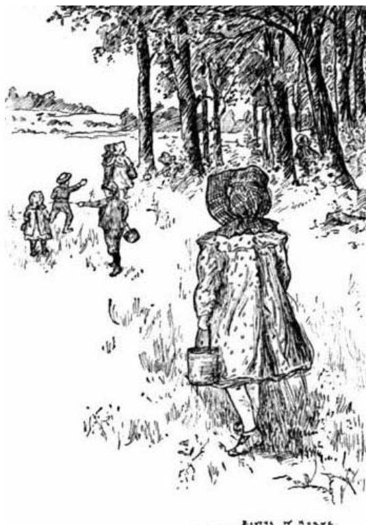
"ANN FOLLOWED GINGERLY IN THEIR WAKE."

It was a dull gray day with a hint of snow in the air. Several flakes fell before they reached the Grayson farm, and Ann pulled aside the lap-robe more than once to peep at the light green shoes with secret misgivings as to their appropriateness. The wool stockings made them such a tight fit that they pinched considerably, but the pinching was more than compensated for by the shapely appearance of her trim little feet. Besides there was a vast amount of satisfaction to the wilful child in the mere knowledge that she was having her own way.