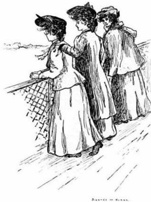
"THREE PRETTY COLLEGE GIRLS LEANED OVER THE RAILING OF THE UPPER DECK." ( See page 1 ).

L.C. PAGE & COMPANY 200 Summer Street Boston, Mass.