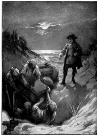
"Two of the pirates went down into the hole."— p. 302.

Abner thought that her advice was very good, and starting up out of the brushwood they hastened home as fast as their legs would carry them.