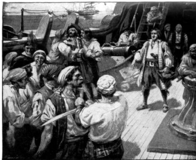
"Morgan began to upbraid them, and ordered them taken below."—p. 151.

Such atrocious wickedness as the treatment of the nuns and monks, described in this chapter, would never have been countenanced in any warfare between civilized nations. But Morgan's pirates were not making war; they were robbers and murderers on a grand scale. They had no right to call themselves civilized; they were worse than barbarians.