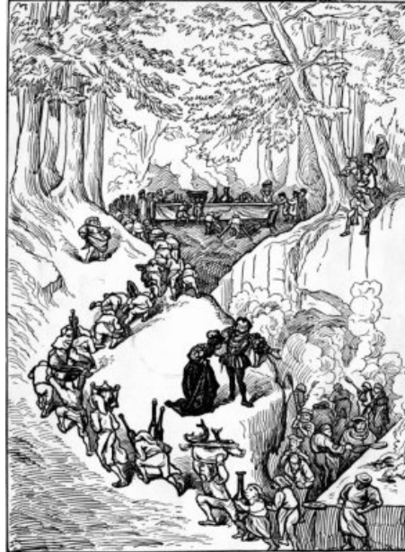
"I am exact in keeping my Word." p. 61.

"Not at all," answered the Princess; "I love you and respect you in all that you mention."