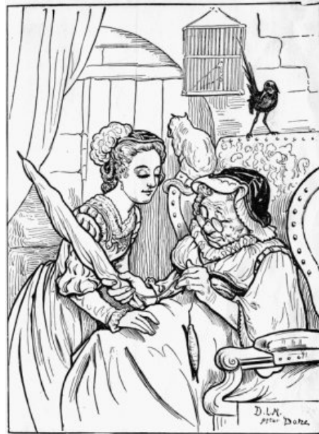
"Let me see if I can do it." p. 15.

beautiful; for her swooning had not dimmed the brightness of her complexion: her cheeks were carnation, and her lips coral. It is true her eyes were shut, but she was heard to breathe softly, which satisfied those about her that she was not dead.