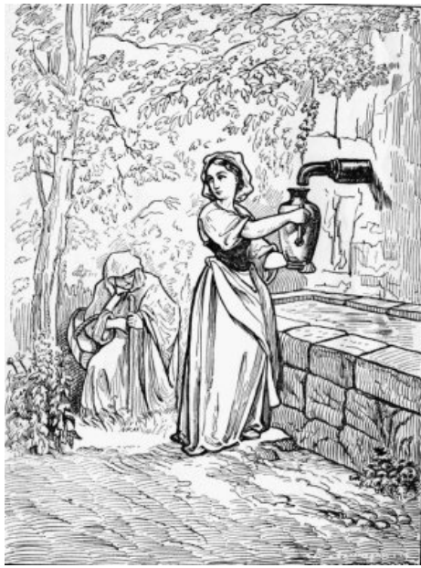
"With All my Heart, Goody." p. 75.

"Truly," cried the mother, "I must send my own dear child thither. Fanny, look at what comes out of your sister's mouth when she speaks. Would you not be glad, my dear, to have the same gift? You have only to go and draw water out of the fountain, and when a poor woman asks you to let her drink, to give it to her very civilly." [Pg 78]