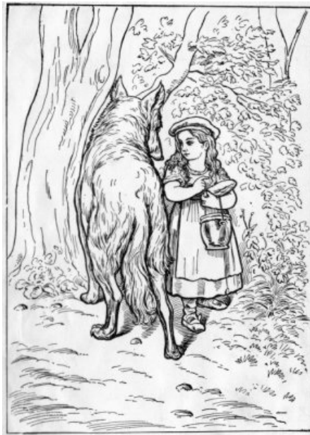
"She met with Gaffer Wolf." p. 80.