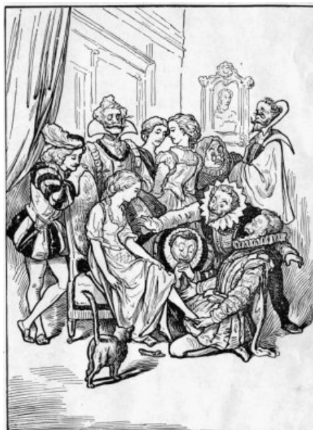
"It went on very easily." p. 10.

He obliged Cinderella to sit down, and, putting the slipper to her little foot, he found it went on very easily, and fitted her as if it had been made of wax. The astonishment of her two sisters was great, but it was still greater when Cinderella pulled out of her pocket the other slipper and put it on her foot. Thereupon, in came her godmother, who, having touched Cinderella's clothes with her wand, made them more magnificent than those she had worn before.