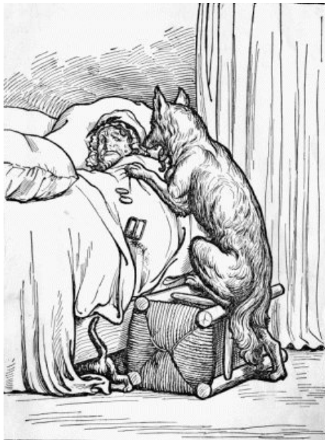
"He fell upon the Good Woman." p. 81.