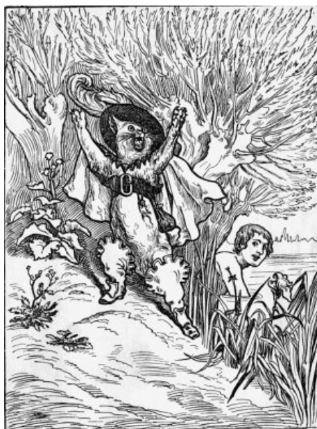
"The Marquis of Carabas is drowning!" p. 48.

While they were drawing the poor Marquis out of the river, the Cat came up to the coach and told the King that, while his master was bathing, there came by some rogues, who ran off with his clothes, though he had cried out, "Thieves! thieves!" several times, as loud as he could. The cunning Cat had hidden the clothes under a great stone. The King immediately commanded the officers of his wardrobe to run and fetch one of his best suits for the Lord Marquis of Carabas.