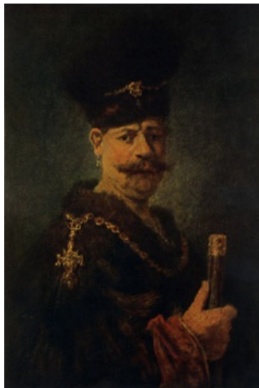
PORTRAIT OF A SLAV PRINCE

*** START OF THE PROJECT GUTENBERG EBOOK REMBRANDT ***