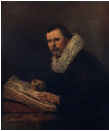
PORTRAIT OF A SAVANT