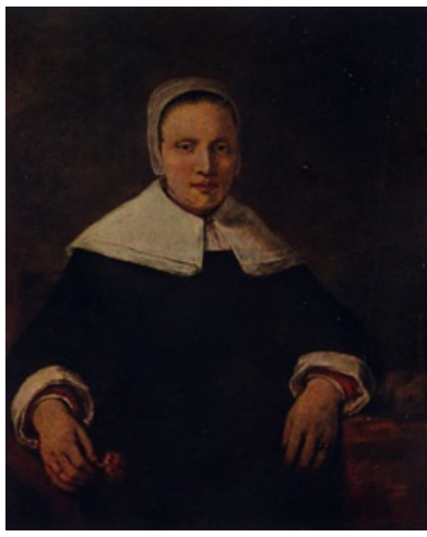
A YOUNG WOMAN IN A RED CHAIR HOLDING A PINK IN HER RIGHT HAND