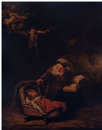
THE HOLY FAMILY WITH THE ANGELS