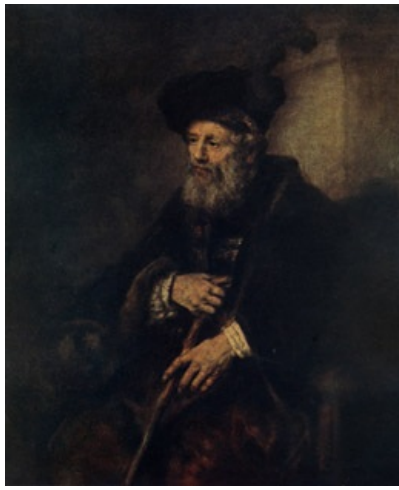
A RABBI SEATED, A STICK IN HIS HANDS AND A HIGH FEATHER IN HIS CAP