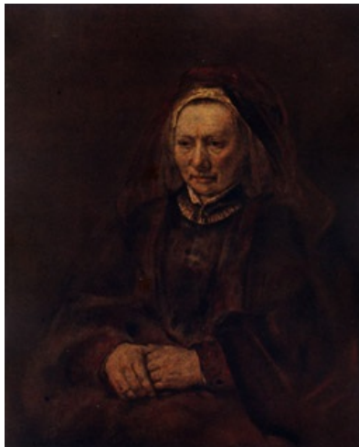
PORTRAIT OF AN OLD LADY IN A VELVET HOOD, HER HANDS FOLDED