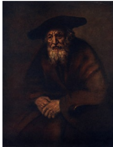
AN OLD MAN WITH A LONG WHITE BEARD, SEATED, WEARING A WIDE CAP, HIS HANDS FOLDED

He wondered how Rembrandt knew what a Rabbi was like. His father might have told him that Rembrandt's pencil and brush were never idle, that he was for ever making pictures of himself, of his father, of his mother, of his wife, of his children and relations, of every interesting type that came within the ken of his piercing eyes; that one day, when he was prowling about the Jews' quarter at Amsterdam, he saw an old, tired, wistful Hebrew sitting in the door of his shop, engaged him in conversation, persuaded him to sit for his portrait, and lo! the nameless Amsterdam Jew became immortal.