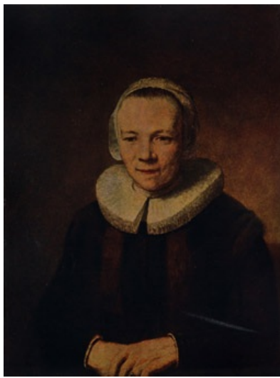
PORTRAIT OF AN OLD LADY, FULL FACE, HER HANDS FOLDED