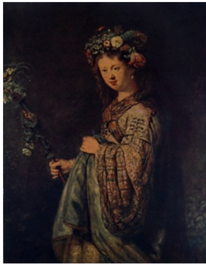
FLORA WITH A FLOWER-TRIMMED CROOK