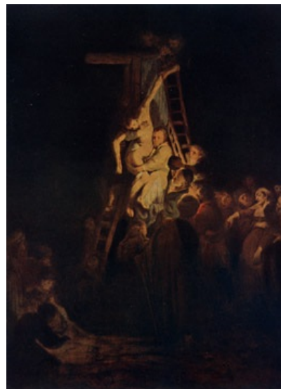
THE DESCENT FROM THE