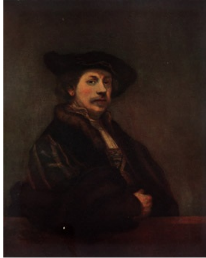
REMBRANDT LEANING ON A STONE SILL

Observe me now! What care I so that I can still see the world and the men and women about me —'When I want rest for my mind, it is not honours I crave, but liberty.'"