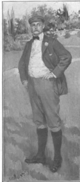
The Marquis of Walderhurst

"I must take care," she said once, quite prosaically, but with more pathos in her voice than she was aware of, "or I shall make my nose quite red."