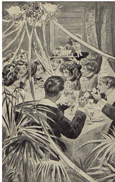
AT SEVEN O'CLOCK A SUPPER WAS SERVED.—P. 129.

"Oh, Helen, I didn't know you had a mule," cried Flossie, and this caused a wild shriek of laughter. [Pg 129]