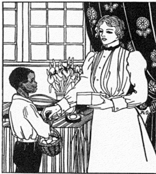
FILLED BOTH HIS HANDS

He looked about him with round, astonished eyes, but never said a word in answer to the eager questions of the girls, beyond a bashful "yessa" or "no'm."