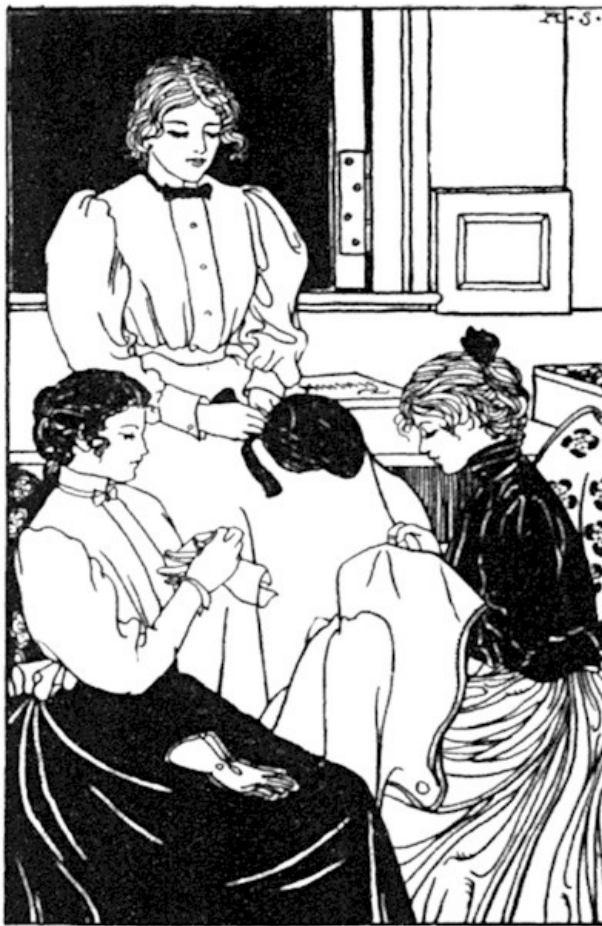
A GROUP OF PRETTY GIRLS SAT ON THE PORCH

A group of pretty girls sat on the porch steps, between the white rose-twined pillars. One of them was tying up the cue of an old-fashioned wig with a black ribbon; another was mending the gold lace on a velvet coat, and the others were busy with the various costumes which they were to wear in the tableaux. Now and then a gay trill or a snatch from some popular song floated out above their laughing chatter. Suddenly one of them looked up and saw John Jay standing in the gravelled drive.