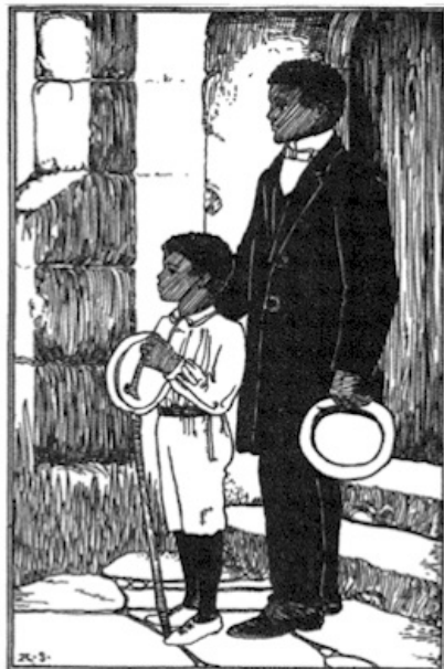
GEORGE CAME OUT AND LOCKED THE DOOR

She shook out Ivy's little blue dress, and began turning it around to find the seam that was ripped. It was drawn together with queer straggling stitches that only the most awkward of fingers could have made. The white buttons on Bud's shirt-waist had been sewed on with black thread, and a spot of blood told where somebody's thumb had felt the sharp thrust of a needle. John Jay's trousers lay at the bottom of the pile, with a little round, puckered patch of calico on each knee.