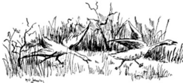
THE GANDERS HAD CHASED HIM AROUND

Once a man had lost his way in this wood, and the ganders had chased him around and around until daylight. The thought made him so weak in the knees that he was ready to drop from fright and exhaustion. Then he recalled a superstition that he had often heard, that anyone who has lost his way may find it again by turning his pocket wrong side out. He was twitching at his with trembling hands, looking with eyes too frightened to see, and fumbling with fingers too stiff with fear to feel, but the pocket seemed to have disappeared. "It's conju'ed too," he wailed, as he ran heedlessly on.