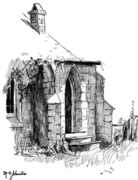
SAT ALONE BY THE CHURCH STEPS

She did not know how many times he slipped away from the other children and sat alone by the church steps, where he had so often listened to George's vesper melodies. She did not know what mournful cadences of memory thrilled him, as he rocked himself back and forth among the dead weeds, with his arms around his knees and his head bowed on them. She knew nothing of the music that had sung wordless longings into his simple child-heart until it awakened answering voices of a deathless ambition. So her surprise knew no bounds when he came slowly into the