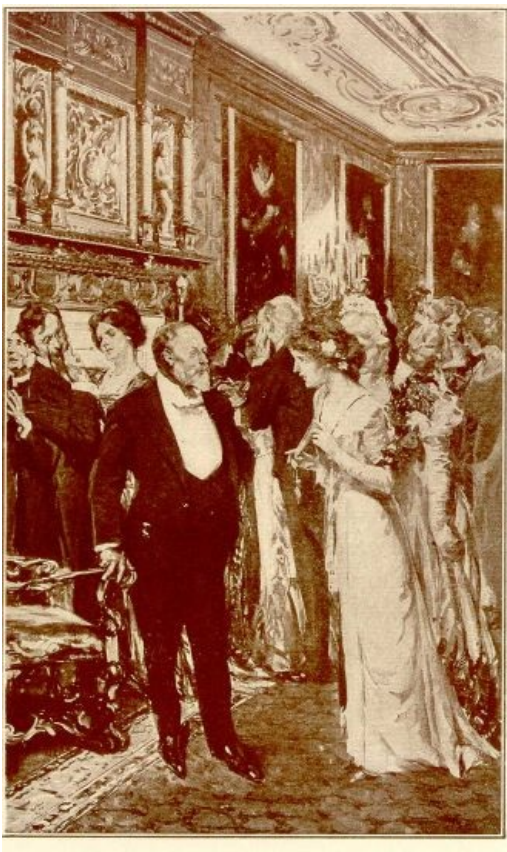
", , , found herself looking into eyes that smiled as with an old friendliness," (Page 103)

that smiled as with an old friendliness. So she smiled back again, and soon forgot the onlookers, answering His Majesty's kindly questions.