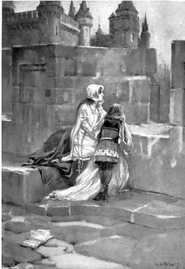
The prisoners of the White Tower.

And as he sang, the Lord of Retz took up the strain, and, with true accord and feeling, [383] accompanied him to the end.