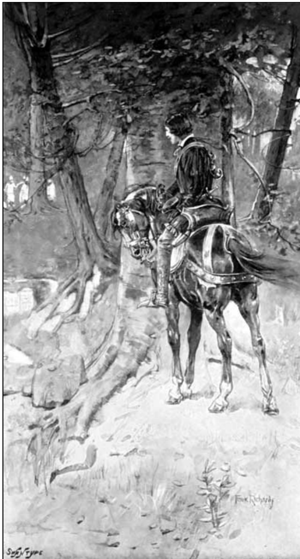
William of Douglas reined up Darnaway underneath the whispering foliage of a great beech.

"Aye, aye," he said, "the Douglas badge is indeed a heart—but it is a bleeding heart. God avert the omen, and keep this young man safe—for though many love him, there be more that would rejoice at his fall."