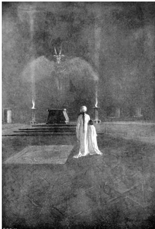
It was like the sudden appearance of two white angels walking fearless and unscathed through the grim dominions of the Lords of Hell.

Incaruate Good had somehow entered the house of the Demon, though it was in the slender periphery of two maidens' bodies, and evil, strong and resistless before, seemed in the moment to lose half its power.