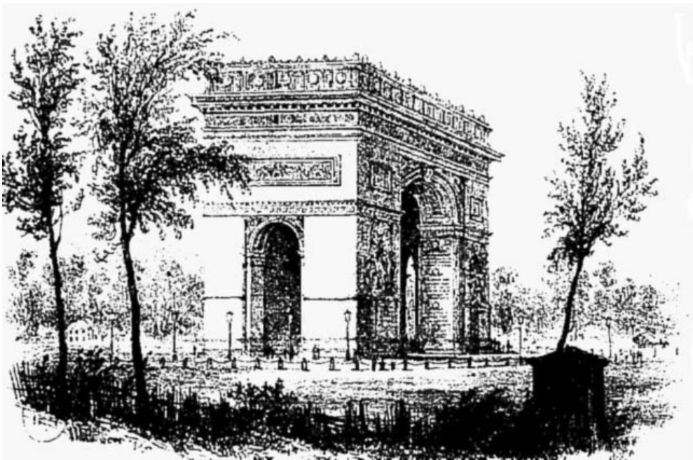
Triumphal Arch.