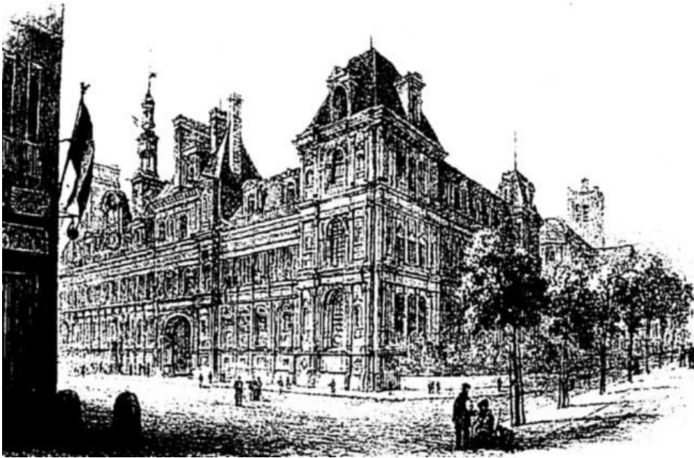
The Hôtel de Ville.

there are several other objects in this noble edifice so interesting, that no person who visits Paris should omit seeing it. We may now take the Rue de la Tixeranderie where at the corner of the Rue du Coq is a house and turret of the 15th and 16th century, most probably the former, according to the statements of M. Dulaure.