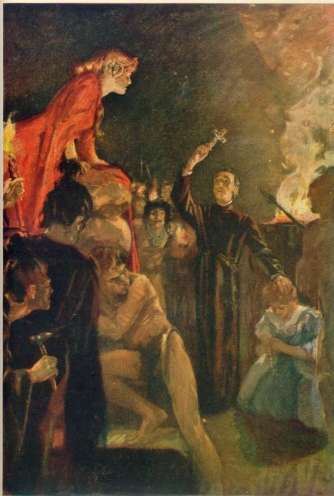
THE WOMAN STOOD GAZING INTENTLY DOWN, HER RED ROBE SWEEPING TO HER FEET; BELOW THE FLARING TORCHES IN THE HANDS OF HER BARBARIC FOLLOWERS CAST THEIR LIGHT FULL UPON HER.