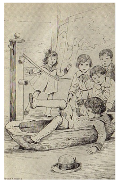
"COME ON NOW, LET'S ALL PULL TOGETHER!" Bunny Brown and His Sister Sue Giving a Show. <u>Page 96</u>

"Come on now, let's all pull together!" suggested Charlie.