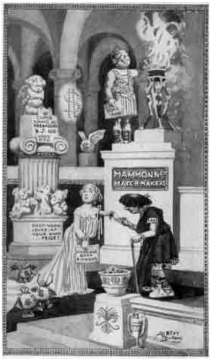
BRANCH OFFICE OF MAMMON & CO.