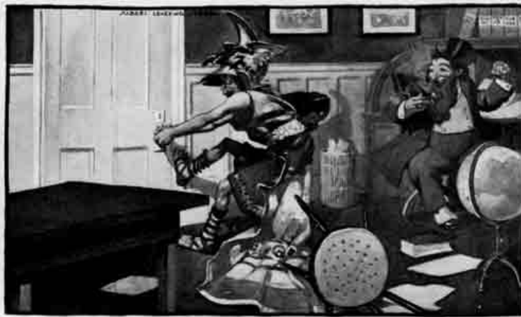
"THE DOOR WAS LOCKED"

"It does me lots of good," he said, with a chuckle. "Really, sir, it gives me a new sensation—first new sensation I have had in a long, long time. Let me see now, just how many names have you called me in the three minutes I have had the pleasure of your acquaintance?" [Pg 181]