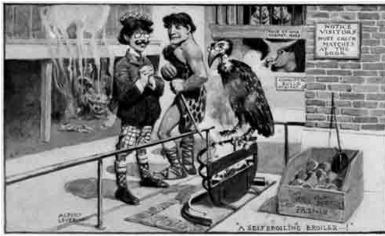
I MEET THE PHOENIX

"I never believed otherwise, my dear Cephalus," said I. "He seems to me to be a unique thing in poultry. If he were a chicken he would be hailed with delight in my country. A self-broiling broiler —!" [Pg 151]