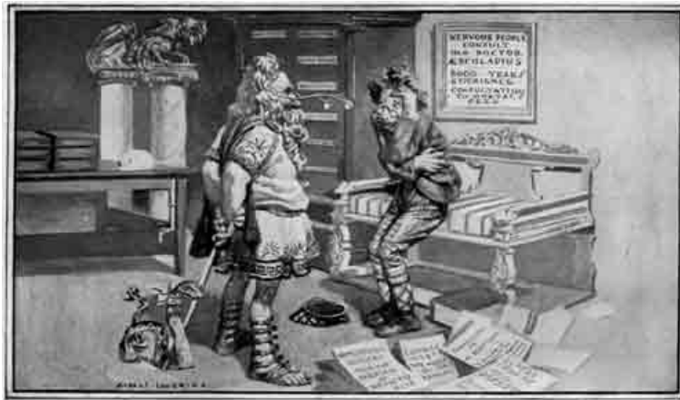
I VISIT ÆSCULAPIUS

"So-called," said he, quietly. "More tooth than wisdom, generally. And not in your throat?" continued the doctor.