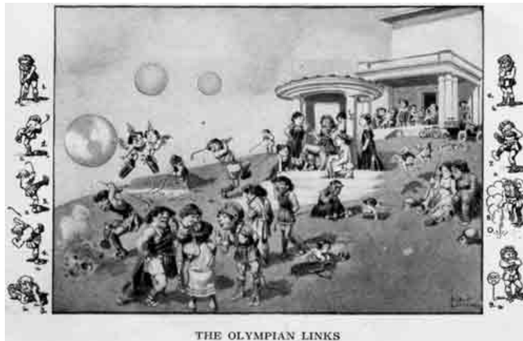
THE OLYMPIAN LINKS

"Very true," said I, reflecting upon the ways of "Some Caddies I have Met." "What do you pay them a round?"