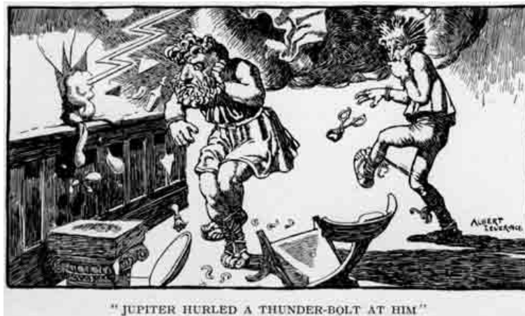
"JUPITER HURLED A THUNDER-BOLT AT HIM"

"I think I'd rather have Jason put on," said Adonis. "While I don't care much for the climate of Hades, I am received there with much consideration socially, whereas up here I am only the valet. One doesn't mind being a nabob once in a while, you know. Besides—ah—don't say anything about it to anybody up here, but I'm getting a trifle tired of Venus. She is still beautiful, but you can't get over the idea that she's over four thousand years old. Furthermore, I met a little Fury down below last season who is simply ravishing." Here Adonis gave me a wink which made me rather curious to see the little Fury.