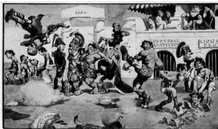
""THE CHAMPIONSHIP OF THE UNIVERSE""

"I should think he would have apologized to Pompey," said I.