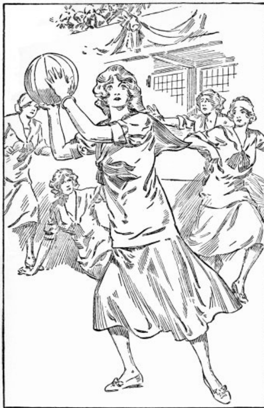
Grace Measured the Distance.

[Pg 187] For the next few minutes pandemonium reigned in the gymnasium. The happy freshmen burst into song and drummed on the floor in expression of their glee. The freshmen team had outplayed that of the sophomores. Only once before in the history of the college had such a thing occurred. To Grace Harlowe and Miriam Nesbit was given the principal credit for this latest victory. Grace's goal toss had been a record-breaker. Never had a freshman been known to make such a toss.