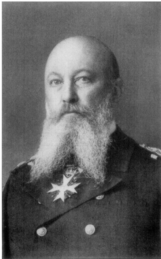
ADMIRAL ALFRED P. VON TIRPITZ LORD HIGH ADMIRAL OF THE GERMAN IMPERIAL NAVY FROM 1911 TO 1916.