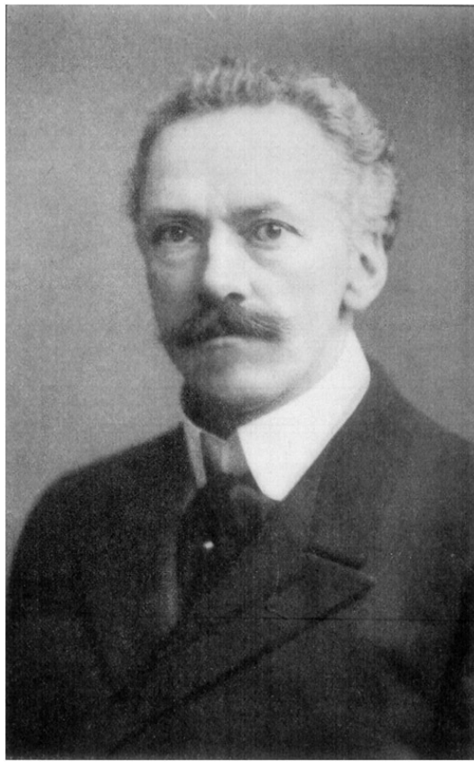
COUNT PAUL WOLFF METTERNICH GERMAN AMBASSADOR TO GREAT BRITAIN FROM 1901 TO 1912.