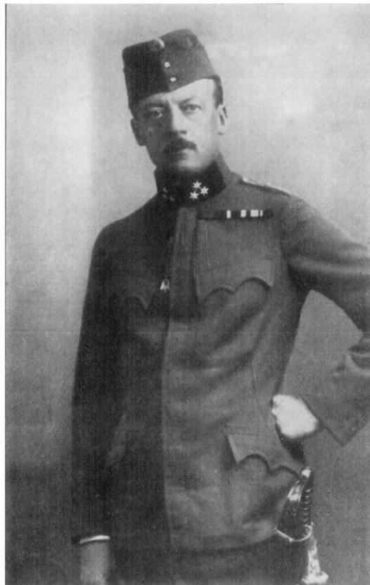
COUNT LEOPOLD BERCHTOLD MINISTER OF FOREIGN AFFAIRS OF AUSTRIA-HUNGARY FROM FEB. 1912 TO JAN. 1915.