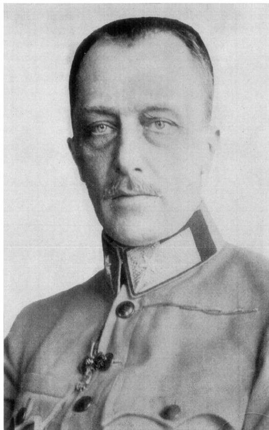
COUNT OTTOKAR CZERNIN MINISTER OF FOREIGN AFFAIRS OF AUSTRIA-HUNGARY FROM DEC. 1916 TO APRIL, 1918.

I will conclude this chapter by appending an estimate of the Emperor William II, which is worth comparing with that of his German Ministers already referred to.