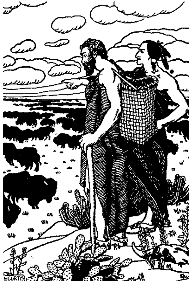
"THE CREATURES DARKENED THE PLAIN ALMOST AS FAR AS EYE COULD SEE."—PAGE 191

"Why do you do this?" asked the medicine man, putting one long bronze finger on the strange marks.