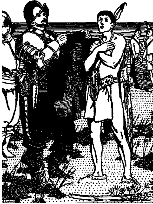
"CORTES FLUNG ABOUT HIS SHOULDERS HIS OWN CLOAK."—PAGE 146