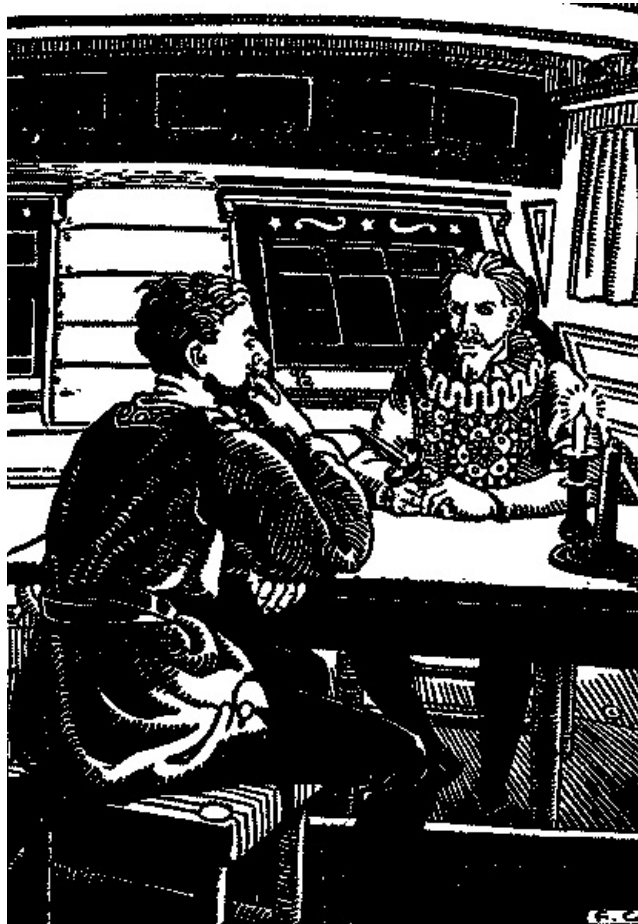
"DRAKE WAS SILENT, FINGERING THE SLENDER MILANESE PONIARD."—PAGE 227