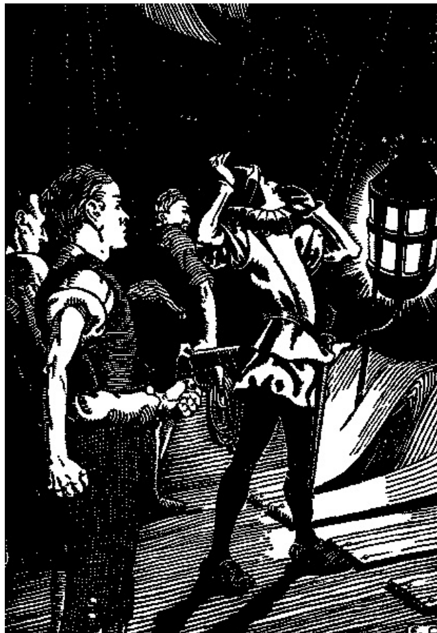
"GENTLEMEN, WHENCE DOES THIS FLEET COME?"—PAGE 204