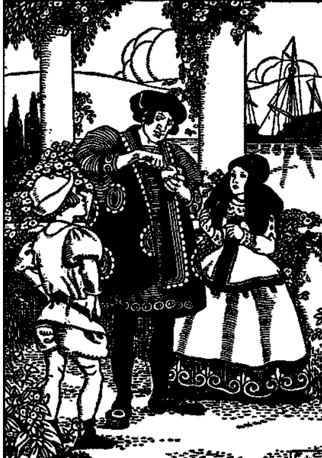
"THE MINIATURE GLOBE TOOK FORM AS THE CHILDREN WATCHED, FASCINATED."—PAGE 44

"But," cried Beatriz wonderingly, "a ship could sail around the world!"