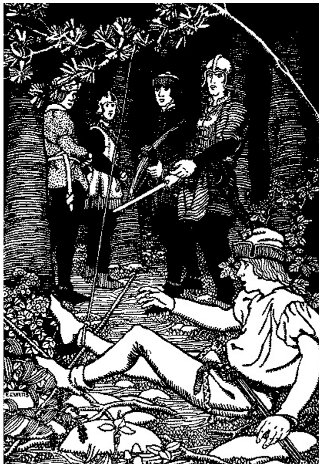
"A SAPLING, BENT DOWN, WAS ATTACHED TO A NOOSE INGENUOUSLY HIDDEN."—PAGE 87

They saw nothing more of the kind, although they sailed some three hundred leagues along the coast, nor did they see any sort of tilled land. This certainly could not be Cipangu or Cathay with their seaports and gilded temples. Whatever else it was, it was a land of wild people, savage hunters. John Cabot left on a bold headland where it could not fail to be seen, a great cross, with the flag of England and the Venetian banner bearing the lion of Saint Mark.