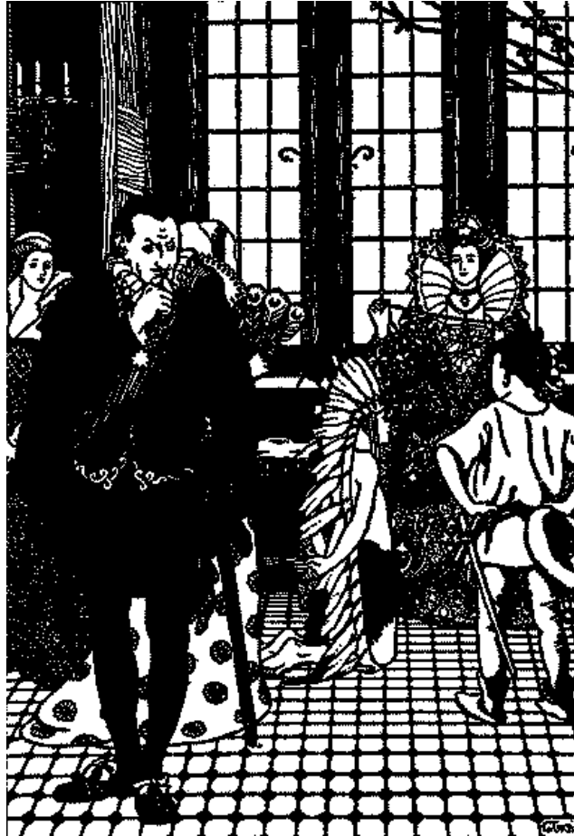
"IF HE HAD TO WEAR HER FETTERS, THEY SHOULD AT LEAST BE GOLDEN."—PAGE 245

On April 27, with a fair wind, the two ships of Raleigh's venture went down to the Channel and out upon the western ocean. They had good fortune, for not a Spaniard crossed their course. Nine weeks later they sighted the coast which the French had once called Carolina. Before they were near enough to see it well they caught the scent of a wilderness of flowering vines and trees blown seaward, and as they neared the shore they saw tall cedars and goodly cypresses, pines and oaks and many other trees, some of them quite unknown to English soil. It is written in Armadas's journal that the wild grapes were so abundant near the sea that sometimes the waves washed over them; and the sands were yellow as gold. The first time that an arquebus was fired, great flocks of birds rose from the trees, screaming all together like the shouting of an army, but there seemed to be no fierce beasts nor indeed any large animals.