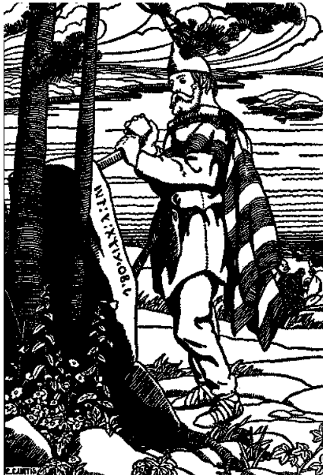
"NILS MARKED OUT AN INSCRIPTION IN RUNIC LETTERS."—PAGE 30

With fury and horror the Norsemen looked upon the destruction. It was all Thorolf and the cooler heads could do to keep the rest from attacking the first Skroelings they saw. But the mischief had been done, without doubt, by the unknown warriors of the plains, who had been perhaps watching their advance. They sadly prepared to return to their boat. But before they went, Thorolf paddled out to the island on two logs, while the others kept guard, and added some lines to the inscription on the stone.