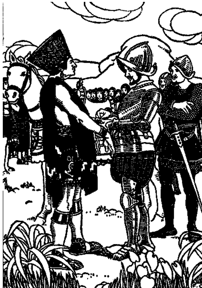
"HE PROPOSED THAT CAONABA SHOULD PUT ON THE GIFT THE SPANISH CAPTAIN HAD BROUGHT."—PAGE 78

Ojeda, who was a perfect horseman, made the horse leap, curvet and caracole, taking a wider circuit each time, until making a long sweep through the forest the two disappeared from the view of the Carib army altogether. Ojeda's own men closed in upon him, bound Caonaba hand and foot, behind their leader, and thus the chief was taken into the Spanish settlement. The conspiracy fell to pieces and the colony was saved.