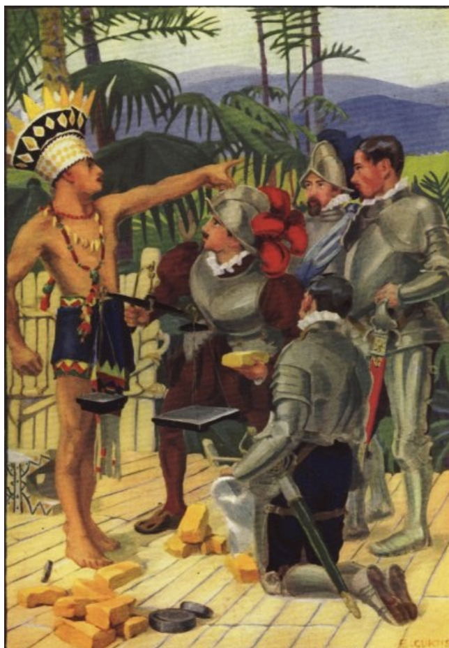
"I WILL TELL YOU WHERE THERE IS PLENTY OF IT!"—FRONTISPIECE