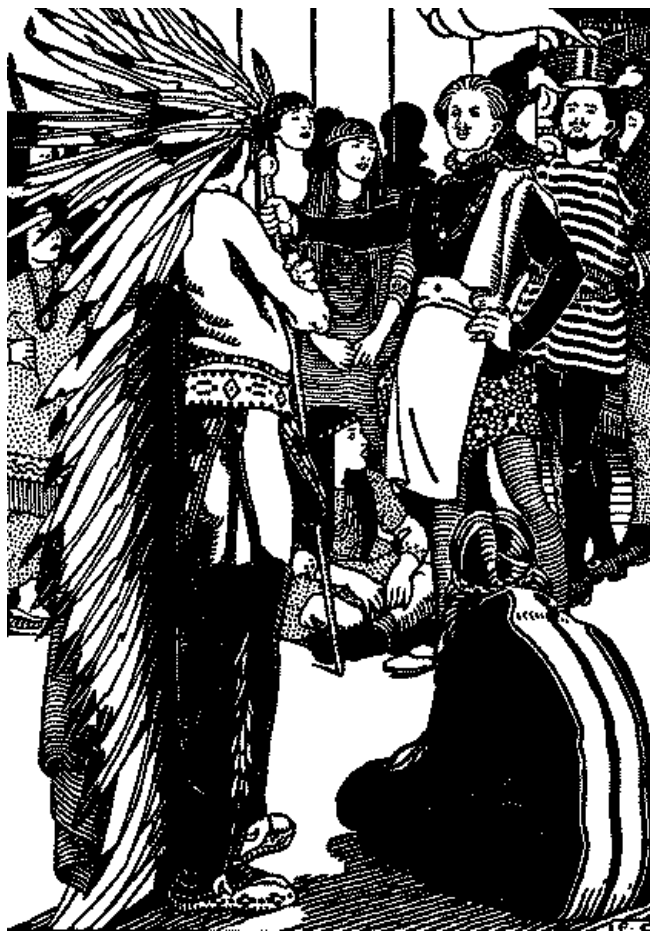
"THE GRAND MASTER OF THE DAY ENTERED THE DINING HALL."—PAGE