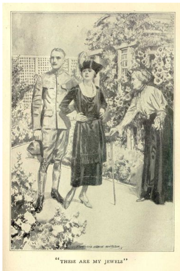
[Illustration: "These are my jewels."]

All the sweetness which had once spread over her domain was concentrated here, fragrance and flame—roses, iris, peonies—honeysuckle—ruby and emerald, amethyst and gold; a Cupid riding a swan, with water pouring from his quiver into a shallow marble basin.