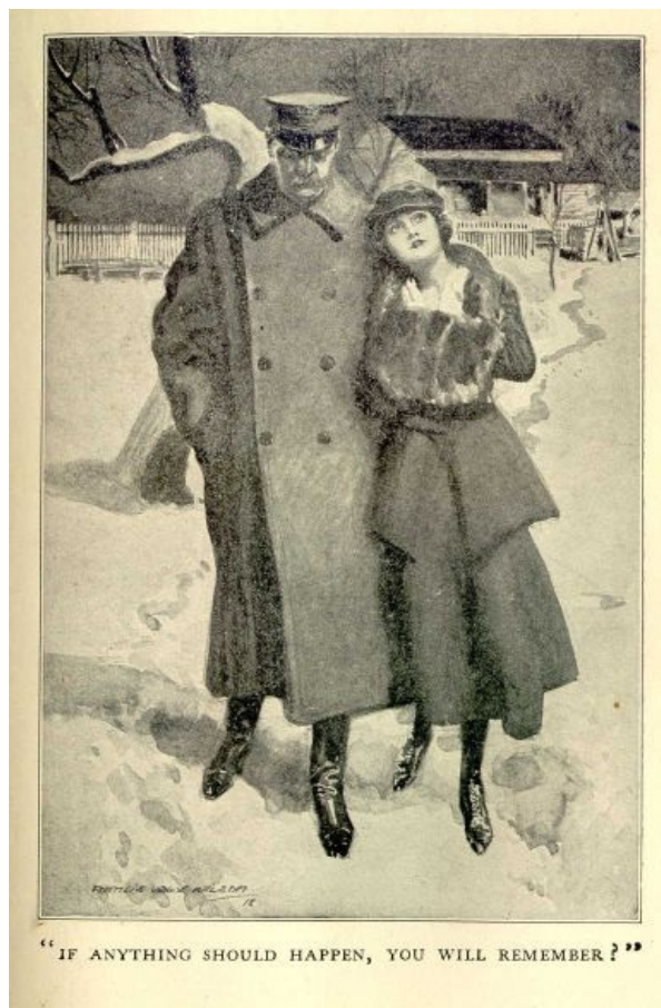
[Illustration: "If anything should happen, you will remember?"]

"Men drift away from these things," he continued, with something of an effort. "I have drifted too far. But, Jean, will you always remember this, that when I am at my best, I come back to the things my mother taught her boy? If anything should happen, you will remember?"