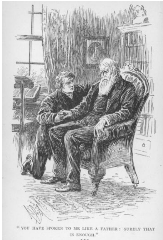
[Illustration: "YOU HAVE SPOKEN TO ME LIKE A FATHER: SURELY THAT IS ENOUGH."]

"You live too much alone, Rabbi," and Carmichael began again as the sense of the tragedy grew on him, "and nurse your conscience till it gets over tender; no other man would dream of ... prosecuting a ... fellow-minister in such circumstances. You have spoken to me like a father, surely that is enough"; and in his honest heat the young fellow knelt down by the Rabbi's chair and took his hand.