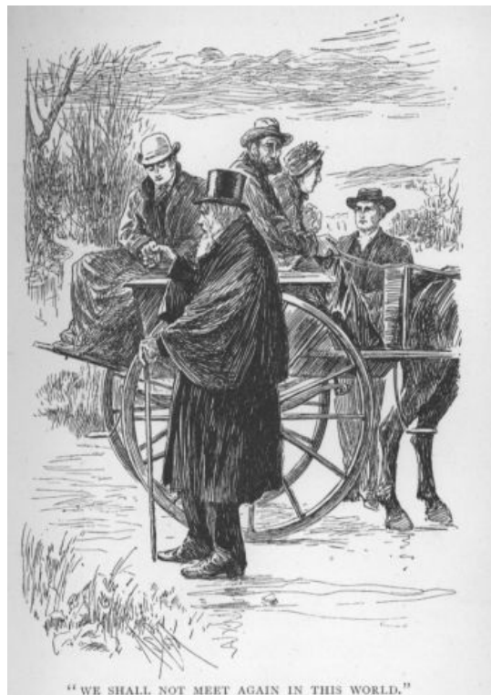
[Illustration: "WE SHALL NOT MEET AGAIN IN THIS WORLD."]

"George," said the Rabbi, looking across the field and speaking as to himself, "we shall not meet again in this world, and in a short space they will bury me in Kilbogie kirkyard, but it will not be in me to lie still for thinking of the people I have loved. So it will come to pass that I may rise—you have ears to understand, George—and I will inquire of him that taketh charge of the dead about many and how it fares with them."