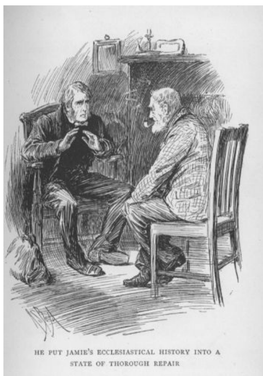
[Illustration: HE PUT JAMIE'S ECCLESIASTICAL HISTORY INTO A STATE OF THOROUGH REPAIR]

Saunderson's election to the Free Church of Kilbogie was therefore an event in the ecclesiastical world, and a consistent tradition in the parish explained its inwardness on certain grounds, complimentary both to the judgment of Kilbogie and the gifts of Mr. Saunderson. On Saturday evening he was removed from the train by the merest accident, and left the railway station in such a maze of meditation that he ignored the road to Kilbogie altogether, although its sign-post was staring him in the face, and continued his way to Drumtochty. It was half-past nine when Jamie Soutar met him on the high road through our glen, still travelling steadily west, and being arrested by his appearance, beguiled him into conversation, till he elicited that Saunderson was minded to reach Kilbogie. For an hour did the wanderer rest in Jamie's kitchen, during which he put Jamie's ecclesiastical history into a state of thorough repair—making seven distinct parallels between the errors that had afflicted the Scottish Church and the early heretical sects, —and then Jamie gave him in charge of a ploughman who was courting in Kilbogie, and was not averse to a journey that seemed to illustrate the double meaning of charity. Jeremiah was handed over to his anxious hosts at a quarter to one in the morning, covered with mud, somewhat fatigued, but in great peace of soul, having settled the place of election in the prophecy of Habakkuk as he came down with his silent companion through Tochty woods.