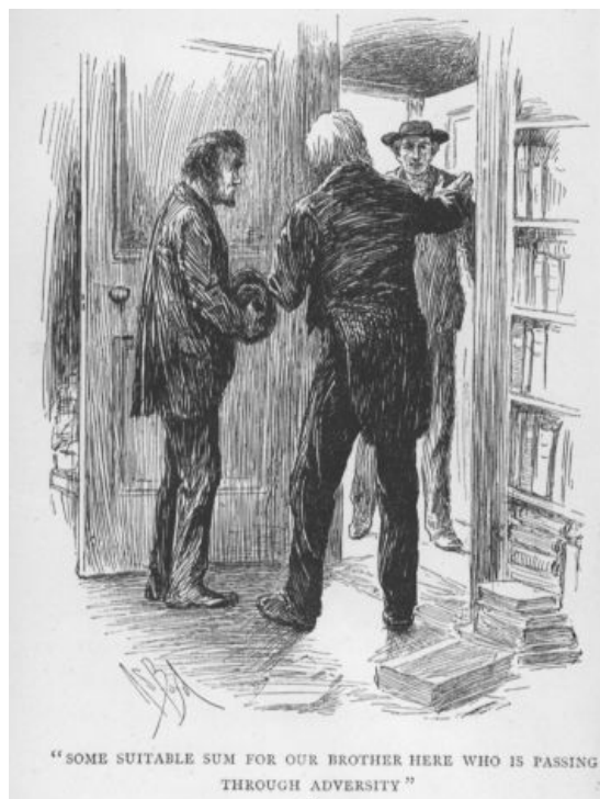
[Illustration: "SOME SUITABLE SUM FOR OUR BROTHER HERE WHO IS PASSING THROUGH ADVERSITY"]

"You will not set it down to carelessness that I cannot quite recall the face of your friend, for, indeed, it is my privilege to see many travellers, and there are times when I may have been a minister to them on their journeys, as I would be to you also if there be anything in which I can serve you. It grieves me to say that I have no clothing that I might offer you; it happens that a very worthy man passed here a few days ago most insufficiently clad and ... but I should not have alluded to that; my other garments, save what I wear, are ... kept in a place of ... safety by my excellent housekeeper, and she makes their custody a point of conscience; you might put the matter before her.... Assuredly it would be difficult, and I crave your pardon for putting you in an ... embarrassing position; it is my misfortune to have to-day neither silver nor gold,"—catching sight of Carmichael in the passage, "This is a Providence. May I borrow from you, John, some suitable sum for our brother here who is passing through adversity?"