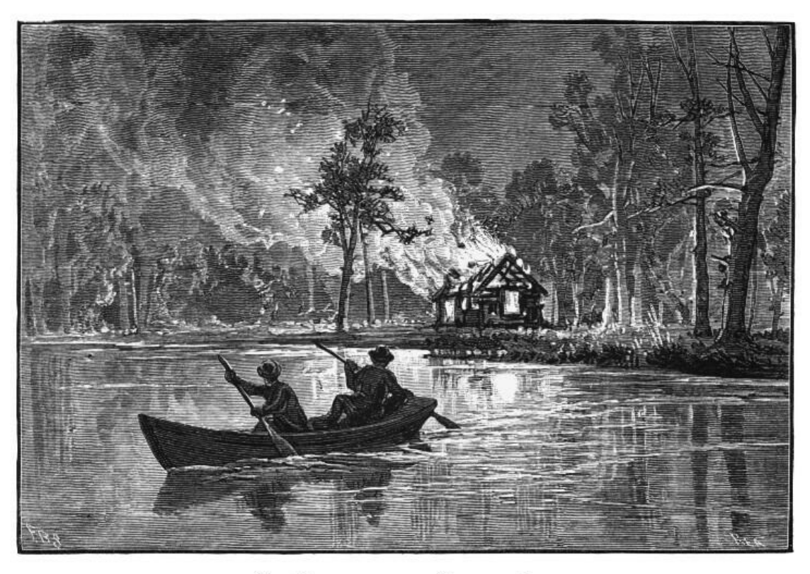
THE BURNING OF THE SHOOTING-BOX.