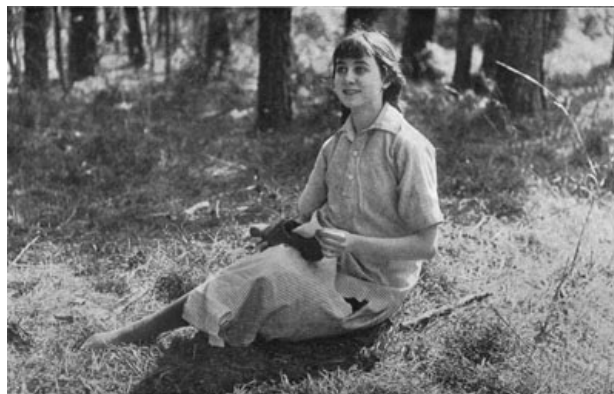
IT WERE A PRINCE—A REAL LIVE PRINCE!

Before Flea could reply, a servant appeared at the door, saying that Mr. Brimbecomb wanted Miss Shellington.