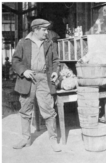
FOR MIDGE'S SAKE

To the left of the Brimbecomb's was the mansion, belonging to the orphans of Horace Shellington. The young Horace and his sister Ann were the favorite companions of Everett Brimbecomb, now six years old. He was a strong, proud, handsome lad. Many conjectures had been made concerning him by the Tarrytown people, because one day five years before the delicate, light-haired wife of Mr. Brimbecomb had appeared with a dark-haired baby boy, announcing that from that day on he would take the place of her own child who had died a few months before. No person had told Everett that the millionaire was not his father, nor was he made to understand that the mother and the home were not his by right of birth. His bright mind and handsome appearance were the pride of his adopted mother's life, and his rich father smiled only the more leniently when the lad showed a rebellious spirit. In the child's dark, limpid eyes slumbered primeval passions, needing but the dawn of manhood to break forth, perhaps to destroy the soul beneath their reckless domination.