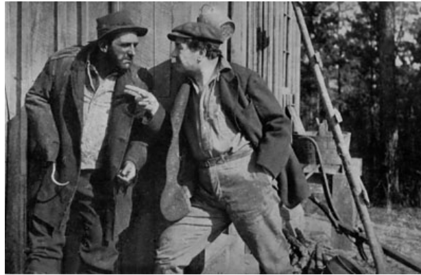
I'M GOIN' TO TAKE HIS KIDS—AND I'LL MAKE OF 'EM WHAT I BE.

"I'm sorry, Katherine," he apologized, and then stopped; for he noticed Everett's face dark with anger. Shellington did not forget that his friends had come to dinner; but he had just witnessed a scene that had touched his heart, and he determined to make both of his guests understand it also.