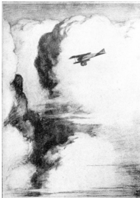
In The Air