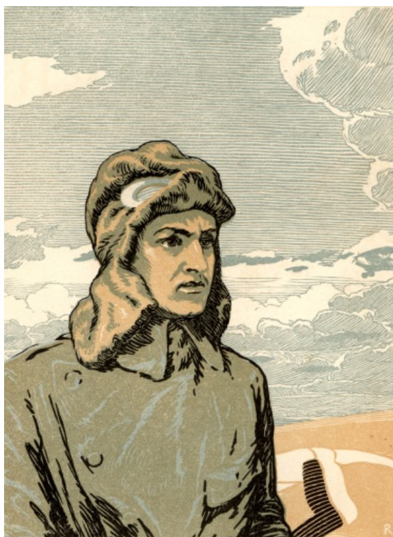
Georges Guynemer, Knight of the Air