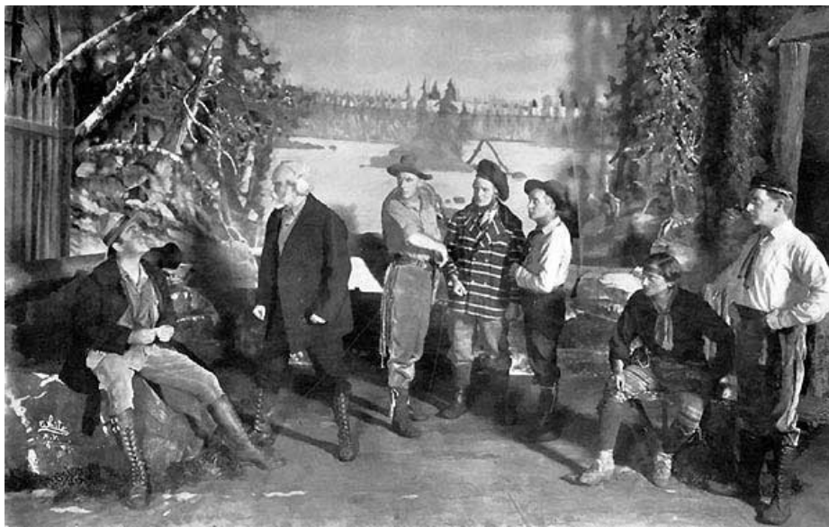
"What you want doesn't concern me in the least." Scene from the play.