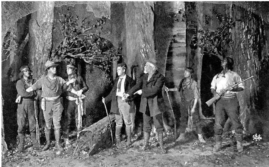
"Go to the devil!" Scene from the play.

"I said five minutes," he repeated. "I mean it."