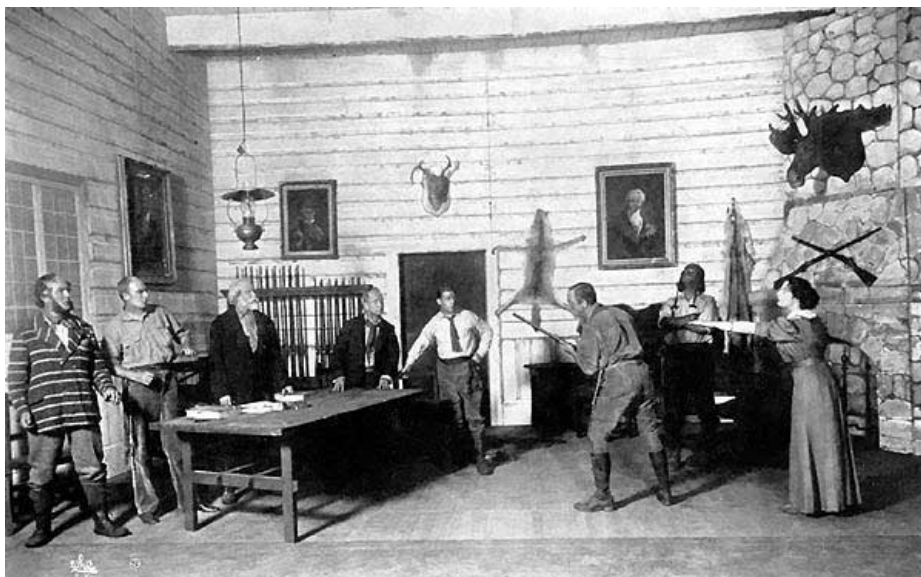
"Do so now!" Scene from the play.

Soon one of the Indian servants entered the room for the purpose of conducting him to a smaller apartment, where he was left alone for some time longer. Food was brought him. He ate heartily, for he considered that wise. Then at last the summons for which he had been so long in readiness. Me-en-gan himself entered the room, and motioned him to follow.