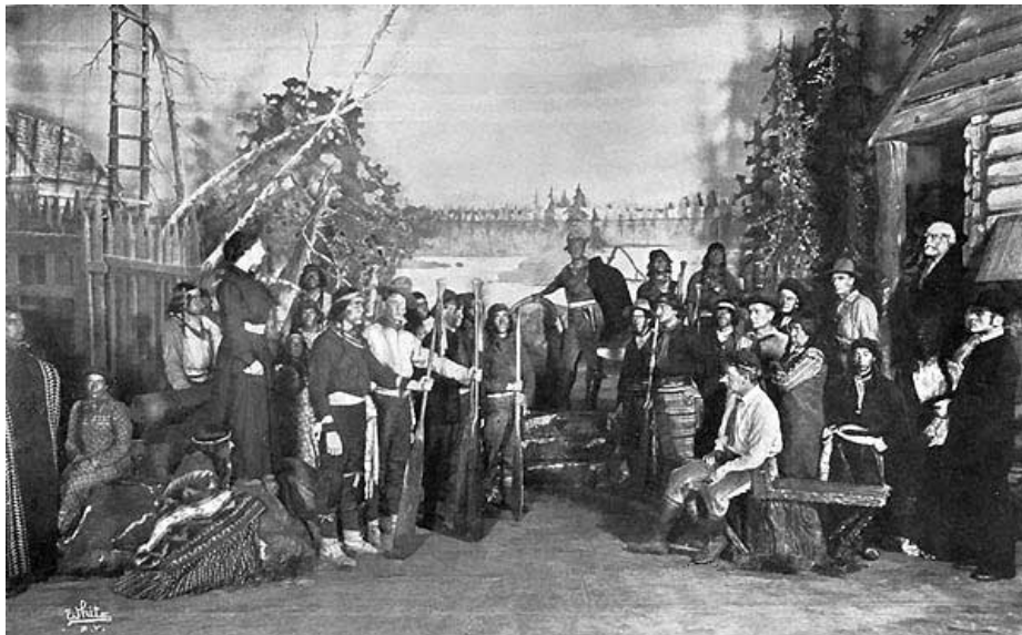
The arrival of the free-trader. Scene from the play.

Galen Albret merely raised his eyebrows.