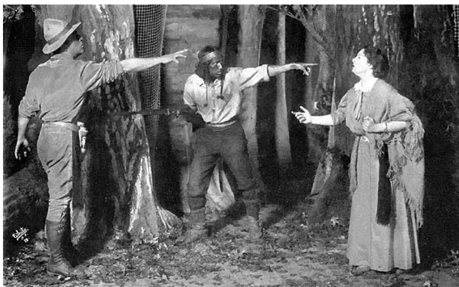
"Go home before they search the woods." Scene from the play.