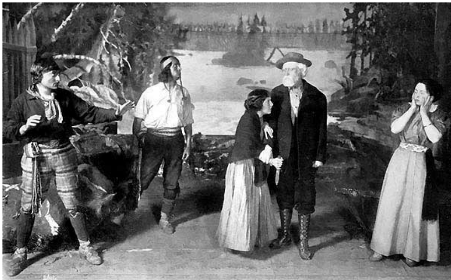
The half-breed seeks to avenge her father. Scene from the play.

Virginia went with this man passively—to an appointment which, but an hour ago, she had promised herself she would not keep. Her inmost soul was stirred, just as before. Then it had been few words, now it was a little common song. But the strange power of the man held her close, so she realized that for the moment at least she would do as he desired. In the amazement and consternation of this thought she found time to offer up a little prayer: "Dear God, make him kind to me."