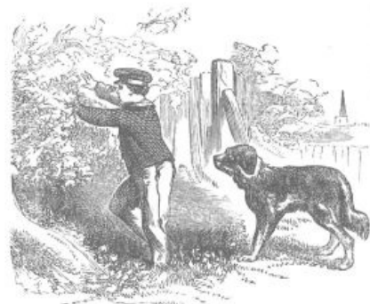
[Illustration: Hunting for Birds' Nests.]

Edward and Alfred were soon upon the other side of the fence. While they were exploring the garden, Oscar's attention was attracted to a dense thicket, from which two or three birds suddenly flew on his approach. He thought there might be a nest there, and concluded to see if he could find it. Carefully brushing aside the leaves and twigs, he began to hunt for the suspected nest, while Tiger stood looking on. Absorbed in this occupation, he lost sight of his comrades.