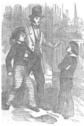
[Illustration: The Assault.]

Whistler hesitated for a moment between the contending impulses of obedience and manliness; and then, drawing himself up to his full stature, he said, with a respectful but decided air: