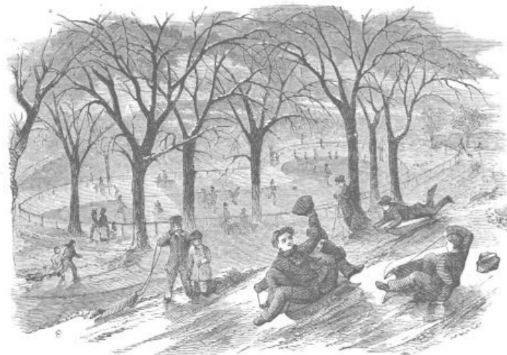
WINTER SCENE ON BOSTON COMMON.

[Frontispiece: Winter Scene on Boston Common.]