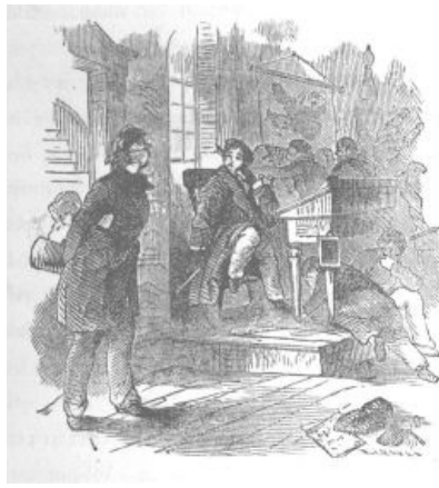
[Illustration: Playing Schoolmaster]

I am sorry that this harmless piece of roguery is not the most serious charge that candor obliges me to bring against Oscar. But to tell the truth, he was not noted either for his studious habits or his correct deportment; and there was very little prospect that he would be considered a candidate for the "Franklin medals," which were to be distributed to the most deserving members of his class, when they graduated, the ensuing July. And yet Oscar was naturally a bright and intelligent boy. He was quick to learn, when he applied himself; but he was indolent, and did not like to take the trouble of studying his lessons. Whenever he could be made to take hold of a lesson in earnest, he soon mastered it; but the consciousness of this power often led him to put off his lessons to the last minute, and then perhaps something would happen to prevent his preparing himself at all.