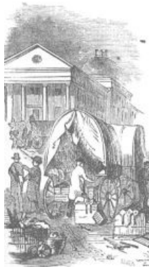
[Illustration: Thanksgiving Market Scene.]

Thanksgiving-Day had come. Among the multitude of good things it brought with it, not the least important, in the eyes of the children, was a visit from their grandmother, Mrs. Lee, who arrived the evening previous. She was the mother of Mrs. Preston, and lived in a distant town in Vermont. She had not visited the family for several years, and the children and their parents were all very glad to see her once more. She was much surprised to find how the young folks had grown since she last saw them. Alice had shot up into a young lady, Oscar, who she remembered as "a little bit of a fellow," was a tall boy, Ella, too, was quite a miss, and Georgie, "the baby," had long since exchanged his frock for the jacket, trowsers, and boots, of boyhood. All these changes had happened since their grandmother's last visit; and yet she was just the same pleasant, talkative old lady that she was years ago. The children could not discover that time had left so much as one new wrinkle on her well-remembered face.