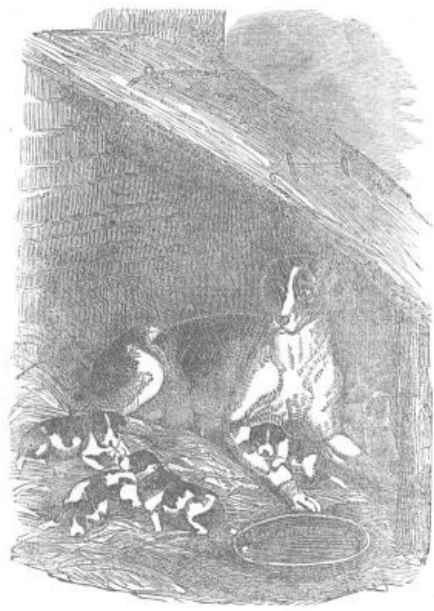
[Illustration: Bright and Her Family.]

"You did n't know father had given all the pups but one to me, did you, Oscar?" inquired Alfred.