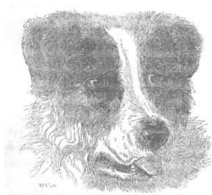
[Illustration: Tiger's Countenance.]

Fastening a string to the neck of the dog, Oscar led him to his new home, where he received every attention from the younger members of the family. Quite a grave discussion at once ensued, as to what the name of the new-comer should be. Each of the children had a favorite name to propose, but Oscar rejected them all, and said the dog should be called "Tiger;" and so that became his name, but it was usually abbreviated to "Tige."