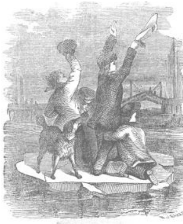
[Illustration: Afloat on the Ice.]

"Halloo, there! send us a boat, will you? we 're sinking!"