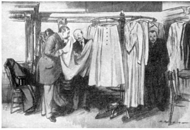
LOOK AT THEM GOODS.

"Sure," Mr. Feigenbaum continued. "It looks to me like somebody laid a cigar on to it and burned a hole there. Then some cabinetmaker fixed it up yet with colored putty and shellac. Nobody would notice nothing except an expert like me, though." [Pg 269]