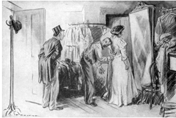
WHAT'S THIS? A NEW CLOAK MODEL YOU GOT?

"Hallo, Mawruss," he cried. "What's this? A new cloak model you got?"