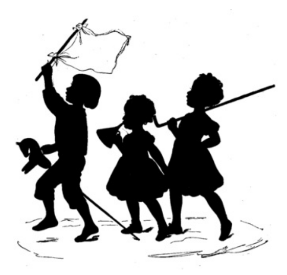
GOING TO THE WARS.

"Sissy, let's come and have a nice quiet walk together, and leave the boys to play by themselves."