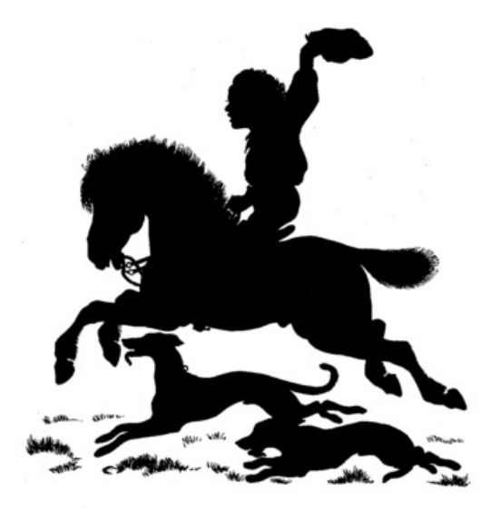
THROUGH THICK AND THIN.

The long summer evening faded away; from my pillow I saw the stars come out one by one, and then kissing my hand to them, I let my sleepy eyes go shut, and was soon in the midst of pleasant dreamland. I don't know how long after this it was, that I was aroused by a sound of whispers at