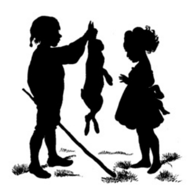
POOR DEAD PUSSY!

There he stood, his eyes and mouth all one smile, and held out at arm's length by the ears a dead rabbit. My look and exclamation of horror made him grave at once.