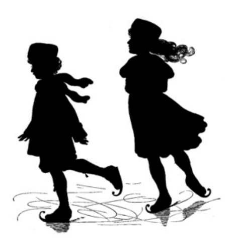
LOOK AT ME!

Meanwhile Christmas was coming, and Christmas weather came sooner still. Then the snow collected outside the nursery window, and the mornings were very dark, and bed the only comfortable place; and Gus's hands got blue, and his face thin and pinched, and he wished himself away with the "Capitaine" in the warm South Seas.