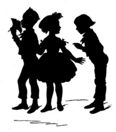
GOING TO A PARTY.

airs and graces for a solemn entrance to the supposed ball-room, when, all of a sudden, who should come round the corner but Uncle Hugh and Harry!