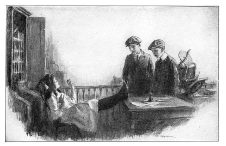
"'Well, men ... I don't want to see any loafin' around here, men. I expect I'll have a pretty good newspaper this week.'"

"Oh, no," she agreed. "I don't say she could.Still, it is rather upsetting, coming so suddenly like this, when not one of the family has ever seen him—never even heard his very name before."