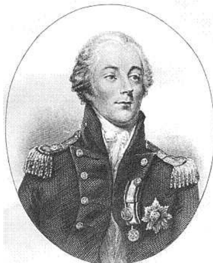
JAMES, LORD DE SAUMAREZ