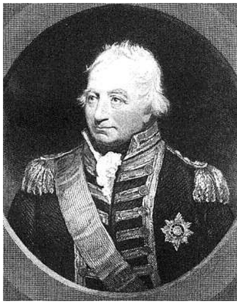
JOHN JERVIS, EARL ST. VINCENT