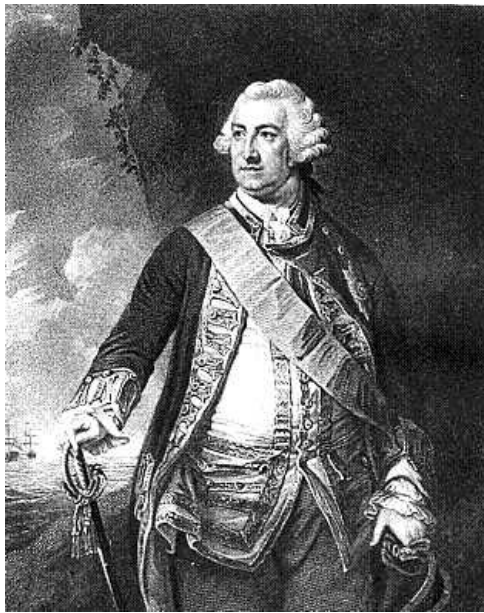
EDWARD, LORD HAWKE

Copyright, 1893, BY HOUGHTON, MIFFLIN AND COMPANY.