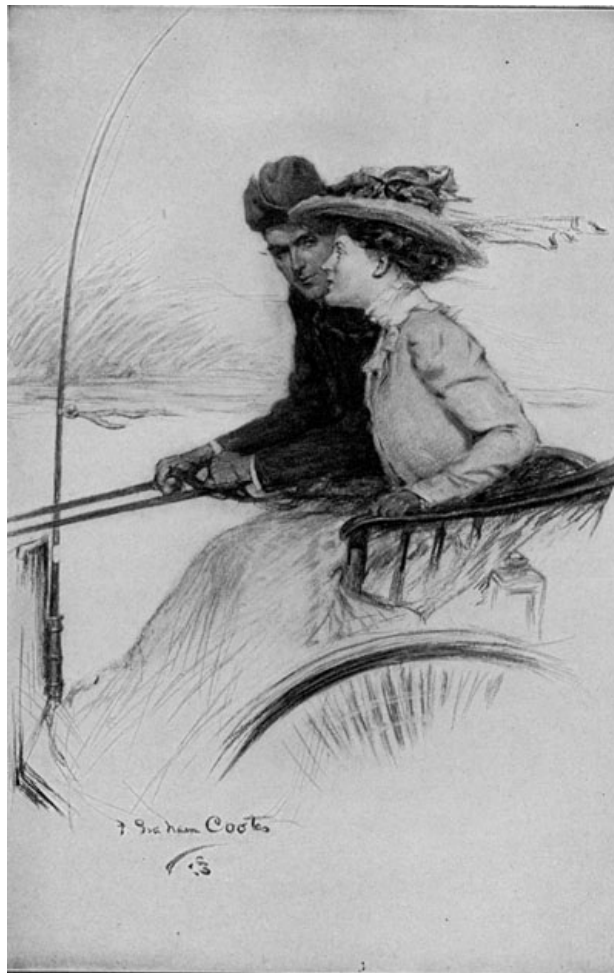
"Go on!" said Judith.

Crittenden laughed, and took off his hat very politely when they met the buggy, but Wharton looked surly. The girl with the black hair looked sharply at Judith, and then again at Crittenden, and smiled. She must have cared little for her companion, Judith thought, or something for Crittenden, and yet she knew that most women smiled at Crittenden, even when they did not know him very well. Still she asked: "And the other things—you meant other women?"