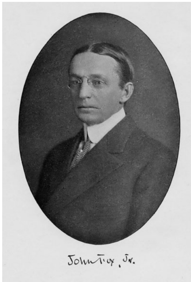
John Fox, Jr.