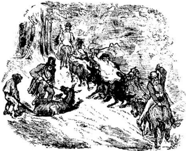
A PIC-NIC AT ENGHEN.

I could not quite like the tone of this; and yet what tenderness was in the man when he turned to his young wife! "St. Omer, Abbeville, Montreuil, and the rest of the places on the line, are dreary holes, I happen to know. You have been to Chantilly, of course?"