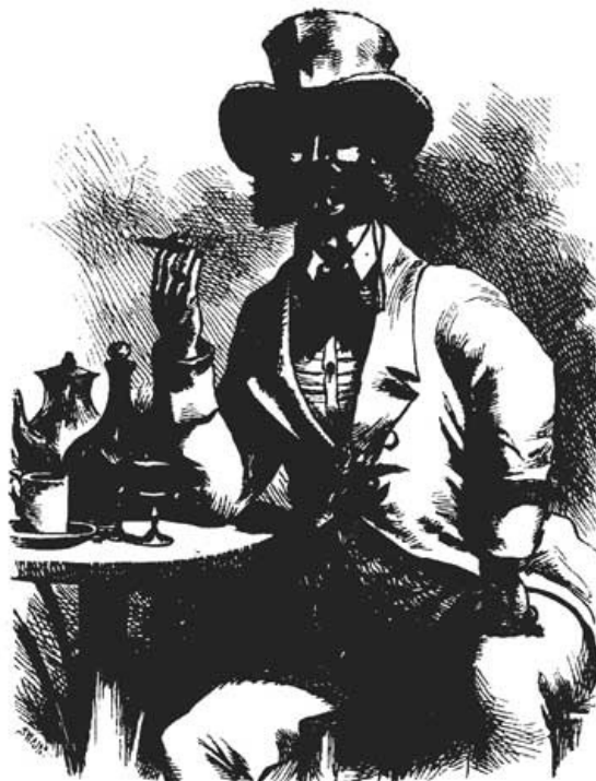
MI LORD ANGLAIS AT MABILLE.

*** START OF THE PROJECT GUTENBERG EBOOK THE COCKAYNES IN PARIS; OR, 'GONE ABROAD' ***