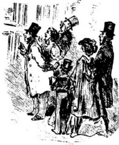
PALAIS DU LOUVRE.

"With all my heart, my dear," said Mr. Cockayne, who was determined to remain in the very best of tempers. "I hope you have been amused, that is all."