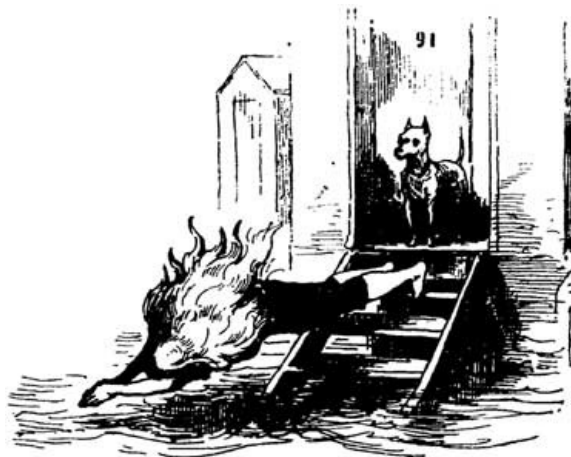
FRENCH RECOLLECTION OF MEESS TAKING HER BATH.