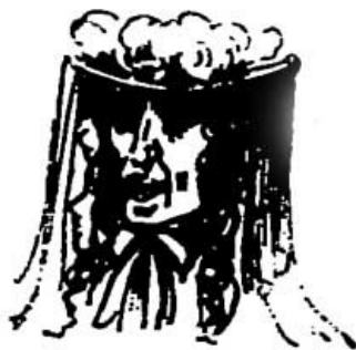
MAMMA ANGLAISE. ( A French design. )