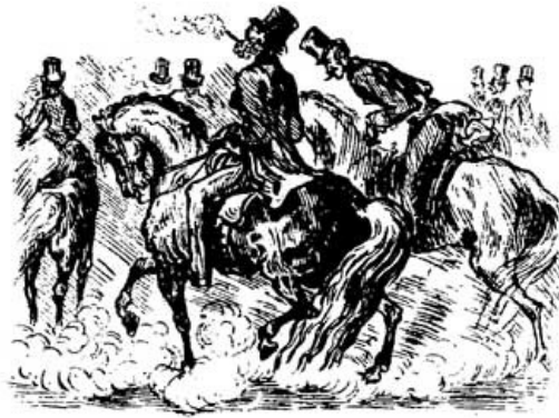
THE ROAD TO THE BOIS.

"We have had a delightful day," said Sophonisba.