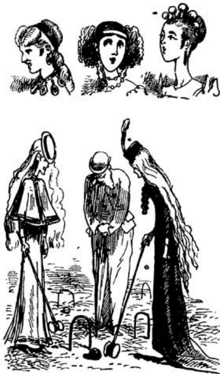
THE INFLEXIBLE "MEESSES ANGLAISES."

They are not impressionable, but they will stoop to "field sports."