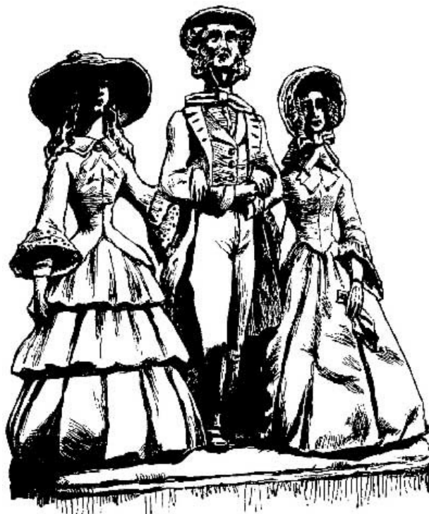
A GROUP OF MARBLE "INSULAIRES." So cold and natural they might be mistaken for life.