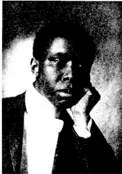
Paul Laurence Dunbar

*** START OF THE PROJECT GUTENBERG EBOOK THE COMPLETE POEMS OF PAUL LAURENCE DUNBAR ***