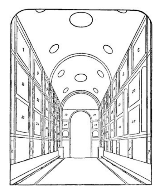
INTERIOR OF THE ARENA CHAPEL, PADUA, LOOKING EASTWARD

The <u>woodcut</u> on <u>p. 27</u> represents the arrangement of the frescoes on the sides, extremities, and roof of the chapel. The spectator is supposed to be looking from the western entrance towards the tribune, having on his right the south side, which is pierced by six tall windows, and on which the frescoes are therefore reduced in number. The north side is pierced by no windows, and on it therefore the frescoes are continuous, lighted from the south windows. The several spaces numbered 1 to 38 are occupied by a continuous series of subjects, representing the life of the Virgin and of Christ; the narrow panels below, marked a, b, c, &c., are filled by figures of the cardinal virtues and their opponent vices: on the lunette above the tribune is painted a Christ in glory, and at the western extremity the Last Judgment. Thus the walls of the chapel are covered with a continuous meditative poem on the mystery of the Incarnation, the acts of Redemption, the vices and virtues of mankind as proceeding from their scorn or acceptance of that Redemption, and their final judgment.