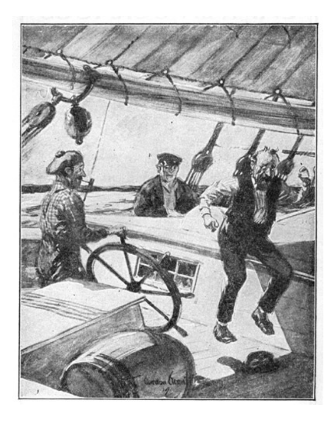
"Captain Scraggs threw his brown derby on the deck and leaped upon it."

*** START OF THE PROJECT GUTENBERG EBOOK CAPTAIN SCRAGGS; OR, THE GREEN-PEA PIRATES ***