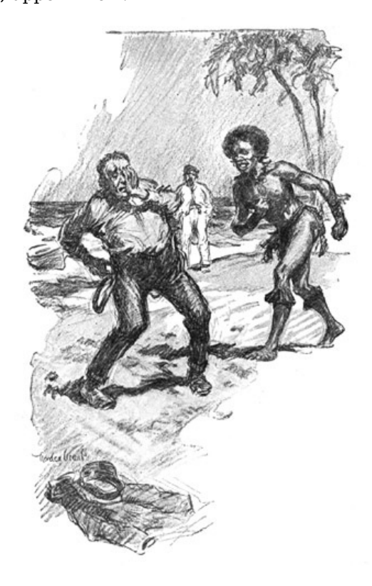
"Tabu-Tabu ... planted a mighty right in the centre of Mr. Gibney's physiognomy"

"The beggar can fight, the beggar can fight," he croaked, wild with joy. "Scraggs, old man, this'll be a rare mill, I promise you. He's been aboard a British man-o'-war and learned how to box. Steady, Gib. Upper-cut him, upper—wow!"