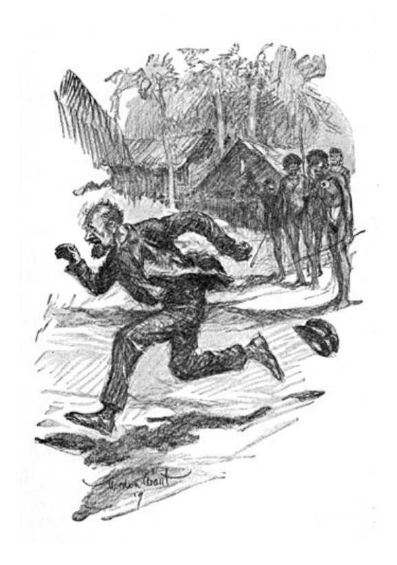
"Captain Scraggs ... broke from the circle of savages ... and fled for the beach"

Pandemonium broke loose at once. Captain Scraggs, after his single shriek for help, broke from the circle of savages and fled like a frightened rabbit for the beach. One of the natives hurled a rock at him. The missile took Scraggs in the back of the head, and he instantly curled up in a heap.