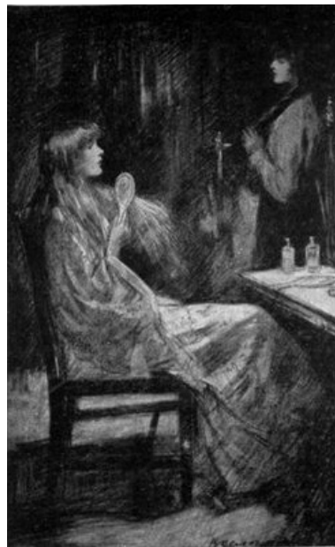
"YOU LOOK NICE—YOU DO REALLY, WITH YOUR HAIR DOWN"

The girls, aghast at the notion of a possible subsidence, made a hasty exit to the open air, and hovered near the entrance in much agitation of mind till the rest of the party made a safe reappearance. Their conductor, with a side glance at the bunch of flowers—which Quenrede ignored—made some reference to the Giant King stone and his whispering companions: he was evidently well versed in all old traditions, though he refrained from mentioning local practices. He walked part of the way home with the Saxons before he branched off to the place where he had left his bicycle.