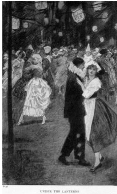
[Illustration: UNDER THE LANTERNS Chapter XX ]

Copyright, 1920, by FREDERICK A. STOKES COMPANY All Rights Reserved First published in the United States of America, 1921