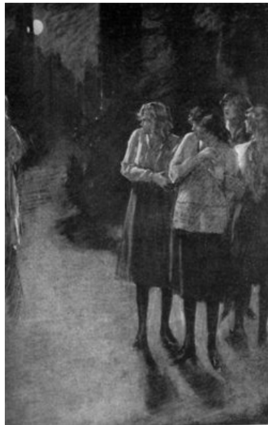
A TALL FIGURE, CLOTHED IN SOME WHITE GARMENT, WAS GLIDING TOWARDS THEM.

What was that, stealing from under the shelter of the hawthorn tree? The girls gasped and almost stopped breathing.