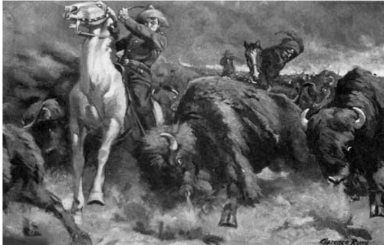
A WAR FOR THE OPEN ROAD AGAINST AN ENEMY WHOSE ONLY WEAPON WAS HIS UNSWERVING BULK. Page 256.

in the swirling maw of a whirlpool; we fought our way rod by rod. Here an opening, and we shot through; there a solid wall of flesh for whose passing we halted, lashing out with quirts and spurring desperately to hold our own—a war for the open road against an enemy whose only weapon was his unswerving bulk. And we won. We pushed, twisted, spurred our way through the ranks of a hundred thousand bison. Jostling, cursing the brute swarm, we crowded our horses against the press, and lo! of a sudden we reined up on open ground—the bison, like a nightmare, were gone. Off in the gloom to one side of us a myriad of hoofs beat the earth, the hoarse coughings continued, the animal odor exhaled—but it was no longer a force to be reckoned with. We were free. We had outflanked the herd.