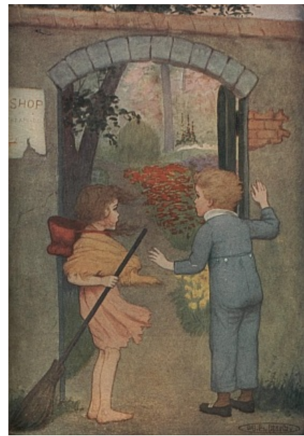
IT WAS THE BACK DOOR OF A GARDEN

She started back at once, ran up the hill and disappeared behind it. Diamond called after her and called, but she did not even turn round. He was sorry to see her go but there was no help for it. So when she was gone quite out of sight, he shut the door of the garden as best he could, and ran through the kitchen garden to the stables. And wasn't he glad to get into his own blessed bed again!