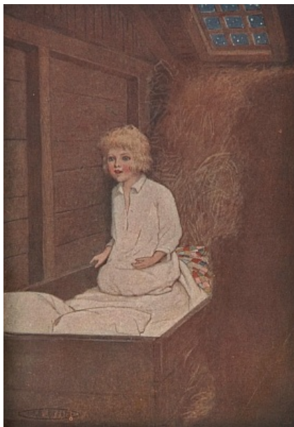
AGAINST THIS HE LAID HIS EAR, AND THEN HE HEARD THE VOICE QUITE DISTINCTLY

Next day, little Diamond forgot all about the hole. But his mother found it when she was making up his bed and pasted a piece of thick brown paper over it. So when Diamond snuggled down into his bed that night, he did not think of it at all. But before he dropped asleep, he heard a queer sound and lifted his head to listen. Was somebody talking to him? The wind was rising again and beginning to blow and whistle. Was it the wind? He moved about to find out who or what it was, and at last, happened to put his hand upon the knot-hole with the paper pasted over it. Against this he laid his ear and then he heard the voice quite distinctly.