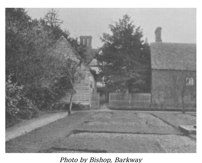
HARE STREET HOUSE FROM THE GARDEN 1914 The timbered building on the left is the Chapel; in the foreground is the unfinished rose-garden.

But now there is a surprise; the back of the house is much older than the front. You see that it is a venerable Tudor building, with pretty panels of plaster embossed with a rough pattern. The moulded brick chimney-stacks are Tudor too, while the high gables cluster and lean together with a picturesque outline. The back of the house forms a little court, with the cloister of which I spoke before running round two sides of it. Another great yew tree stands there: while a doorway going into the timber and plaster building which I mentioned before has a rough device on it of a papal tiara and keys, carved in low relief and silvered.