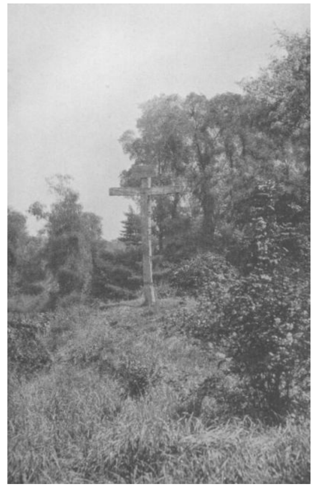
THE CALVARY AT HARE STREET, 1913 The grave is to the left of the mound.