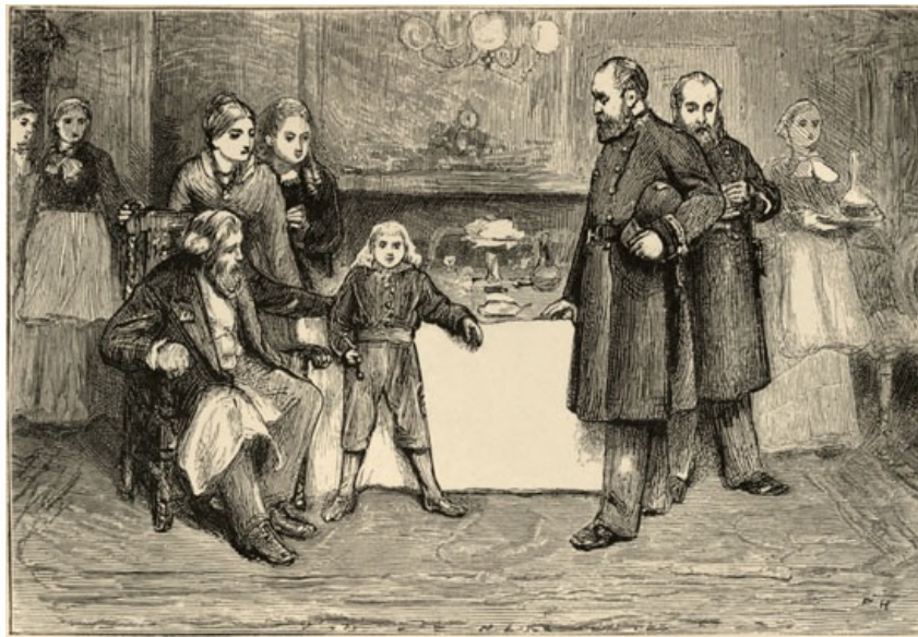
THE BOY WHO FOUND THE BLUDGEON.