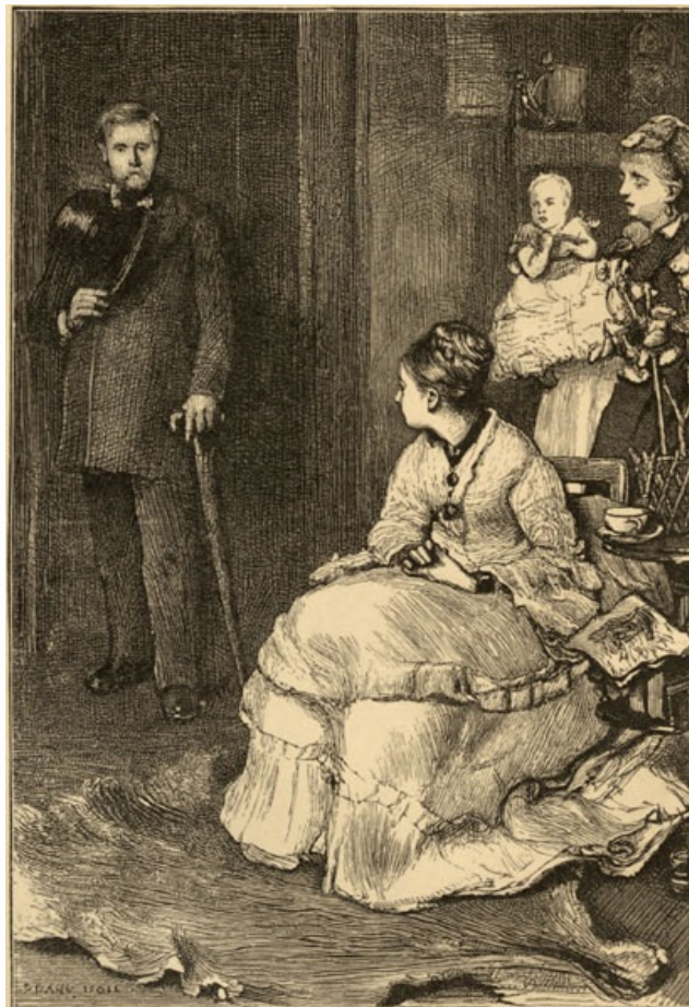
LADY CHILTERN AND HER BABY.

He reached Harrington Hall in the afternoon about four, and found Lady Chiltern alone. As soon as he saw her he told himself that she was not in the least altered since he had last been with her, and yet during the period she had undergone that great change which turns a girl into a mother. She had the baby with her when he came into the room, and at once greeted him as an old friend,—as a loved and loving friend who was to be made free at once to all the inmost privileges of real friendship, which are given to and are desired by so few. "Yes, here we are again," said Lady Chiltern, "settled, as far as I suppose we ever shall be settled, for ever so many years to come. The place belongs to old Lord Gunthorpe, I fancy, but really I hardly know. I do know that we should give it up at once if we gave up the hounds, and that we can't be turned out as long as we have them. Doesn't it seem odd to have to depend on a lot of yelping dogs?"