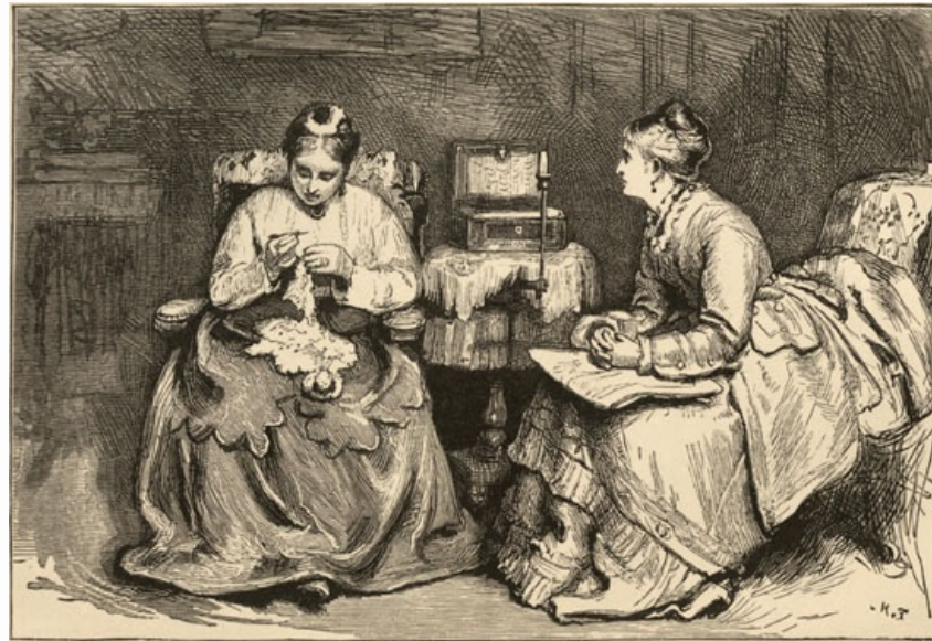
"THEY SEEM TO THINK THAT MR. BONTEEN MUST BE PRIME MINISTER."

"You saw The People's Banner, Mrs. Bonteen, on Monday?" Lady Eustace had been reading the paper in her friend's drawing-room. "They seem to think that Mr. Bonteen must be Prime Minister before long."