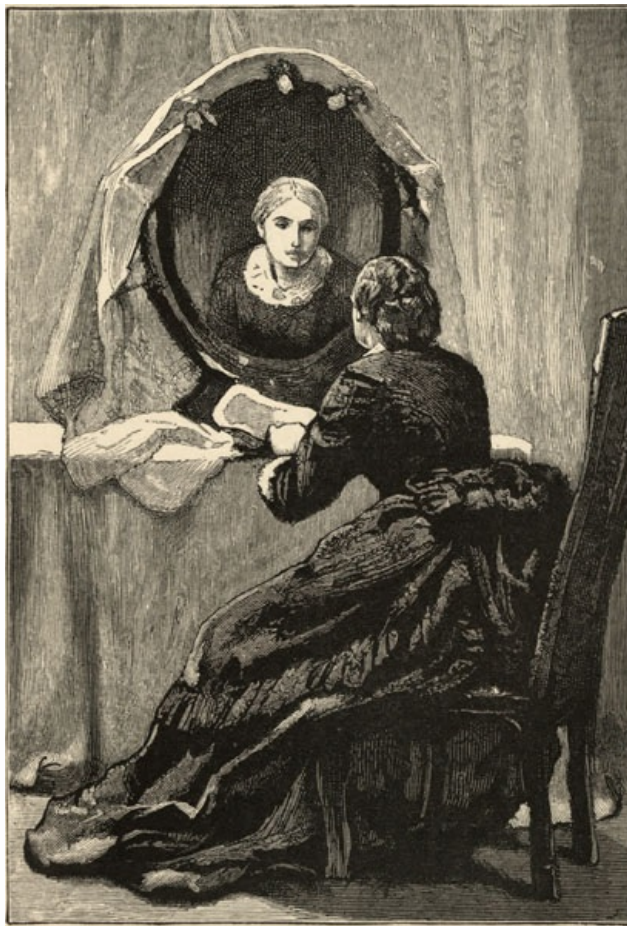
LADY LAURA AT THE GLASS.