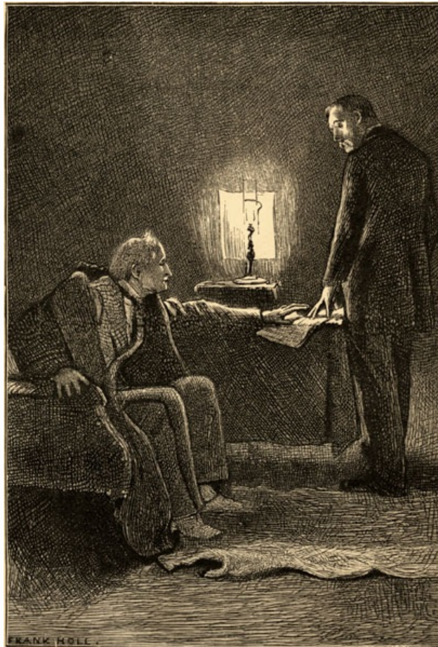
THE LAIRD OF LOUGHLINTER.

forth his open hand as though to hide his countenance, and Phineas hardly knew whether the absurdity of the movement or the tragedy of the feeling struck him the more forcibly. "What did I do that she should leave me? Did I strike her? Was I faithless? Had she not the half of all that was mine? Did I frighten her by hard words, or exact hard tasks? Did I not commune with her, telling her all my most inward purposes? In things of this world, and of that better world that is coming, was she not all in all to me? Did I not make her my very wife? Mr. Finn, do you know what made her go away?" He had asked perhaps a dozen questions. As to the eleven which came first it was evident that no answer was required; and they had been put with that pathetic dignity with which it is so easy to invest the interrogatory form of address. But to the last question it was intended that Phineas should give an answer, as Phineas presumed at once; and then it was asked with a wink of the eye, a low eager voice, and a sly twist of the face that were frightfully ludicrous. "I suppose you do know," said Mr. Kennedy, again working his eye, and thrusting his chin forward.