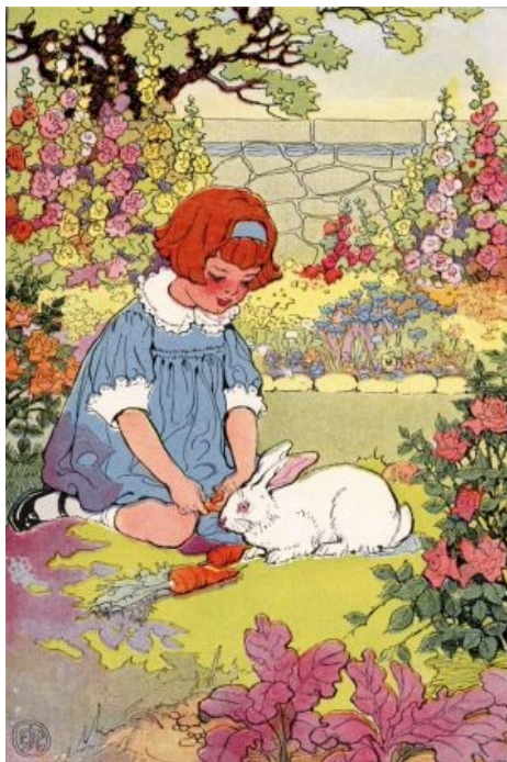
He couldn't believe it was anything but a magic carrot

Bumper spent the night in a box lined with fresh, green grass at the foot of the little girl's bed, but not until after he had met another person whom he feared and disliked almost as much as the bad boy called Toby. She was a cross old nurse, who looked after Edith, and she didn't like rabbits—not live ones. She admired Bumper's soft, white hair, and remarked: