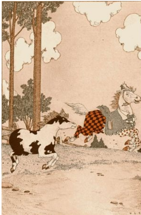
Twinkleheels Races With Ebenezer.