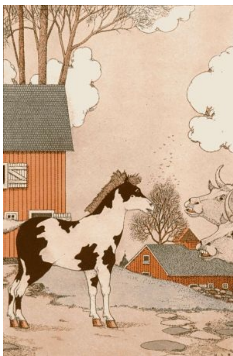
Twinkleheels Talks to the Oxen. (Page 54)

"There won't be any school to-day!" he cried. And he hurried into his clothes much faster than he usually did.