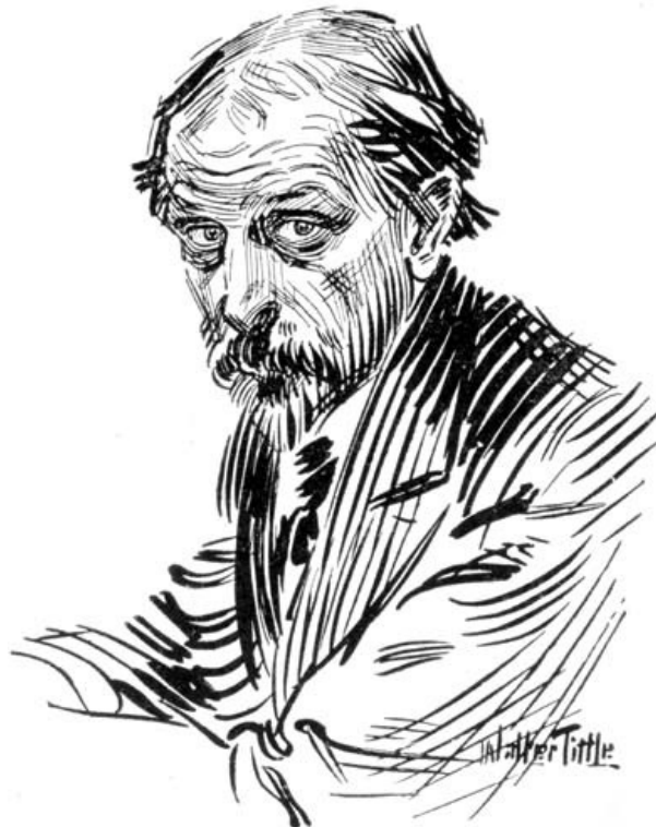
Some poor old worn-out story-writer

"Oh, ho!" said the Doctor. "So that's the trouble is it! It isn't just rheumatism that's keeping you thin and worried looking, eh? It's only that you find yourself suddenly in the embarrassing predicament of being engaged to one girl and—in love with another?" [101]