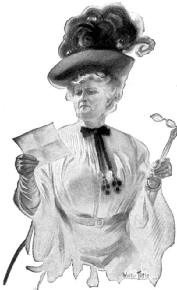
Cornelia's mother answered this time

Cornelia's mother answered this time. The telegram fairly rustled with sarcasm. "You don't seem to be very sure about anything," said Cornelia's mother.