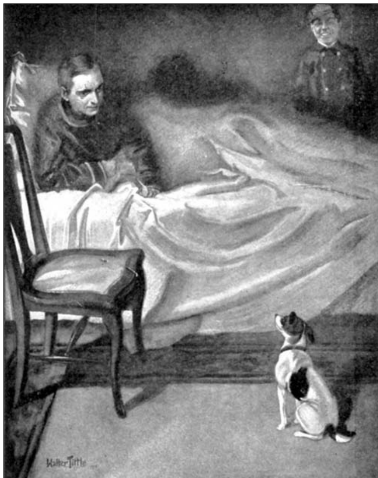
A much-freckled messenger-boy appeared dragging an exceedingly obstreperous fox-terrier

"P. S. Just turn the puppy out in the morning and he'll go home all right of his own accord."