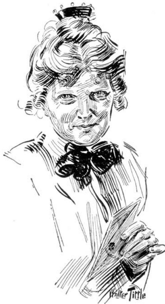
An elderly dame

Where now was Stanton's boasted sense of honor concerning the ethics of playing the game according to directions? "Wait a whole hour to see what Molly looked like? Well he guessed not!" Fumbling frantically under his pillow and across the medicine stand he began to search for the missing "No. 4 o'clock." Quite out of breath, at last he discovered it lying on the floor a whole arm's length away from the bed. Only with a really acute stab of pain did he finally succeed in reaching it. Then with fingers fairly trembling with effort, he opened forth and disclosed a tiny snap-shot photograph of a grim-jawed, scrawny-necked, much be-spectacled elderly dame with a huge gray pompadour. [45]