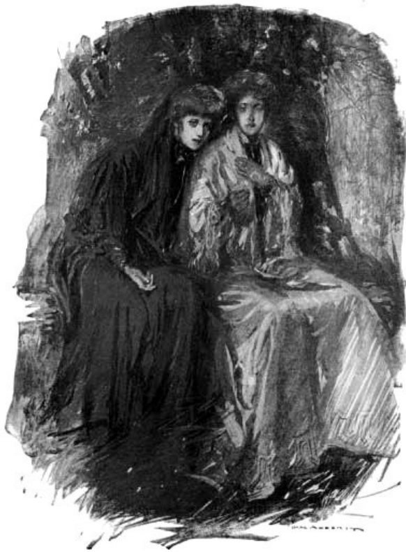
““ YOU ARE ALL BLINDER ONE THAN THE OTHER, THAT IT'S ANDREA I'M GRIEVING FOR ””

Wentworth had almost given up hope of a word with Fay until he saw her sitting with Magdalen in the avenue. The world would be a much harder place than it already is for women to live in if men concealed their feelings. A reverent and assiduous study of the nobler sex leads the student to believe that they imagine they conceal them. But it is women who early in life are taught to acquire this art, at any rate when they are bored. Half the happy married women of our acquaintance would be the widows of determined suicides if women allowed it to appear when they were bored as quickly as men do.