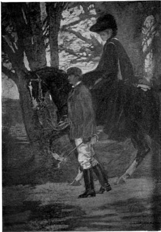
"FAY NOTICED FOR THE FIRST TIME HOW LIGHTLY WENTWORTH WALKED, HOW SQUARE HIS SHOULDERS WERE"

charmingly with a love scene. The small service he had rendered Fay linked itself to a wish to do something more for her—he did not know exactly what—but something larger than to-day. Any fool, any bucolic squireen, could have given her a lift home on a cob. He would like to do something which another person could not do, something which would cheer her, console her, and at the same time place him in a magnanimous light.