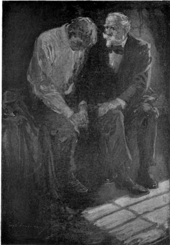
“ ‘ IS SHE WORTH IT?’ HE SAID WITH SUDDEN PASSION ”

"He will, only because he must," said Michael, catching his breath. "I had thought of that. He can do nothing. Have I not accused myself? And his honour is also hers. They stand and fall together."