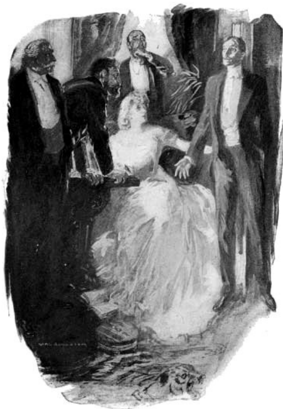
"A DEATHLIKE SILENCE FOLLOWED THE DELEGATO'S WORDS"

A deathlike silence followed the delegato's words.