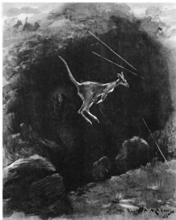
A LEAP FOR LIFE

The little girl didn't understand why the Kangaroo wanted her to make a noise, and she had, in her fear and sorrow, quite forgotten their pursuers. But now she turned, and could hear the Blacks urging on their dogs as they were making an attempt to skirt round the precipice, and gain the other side of the chasm. So Dot did as she was told, and screamed and cried like the most naughty of children; and the gasping Kangaroo told her to go on doing so.