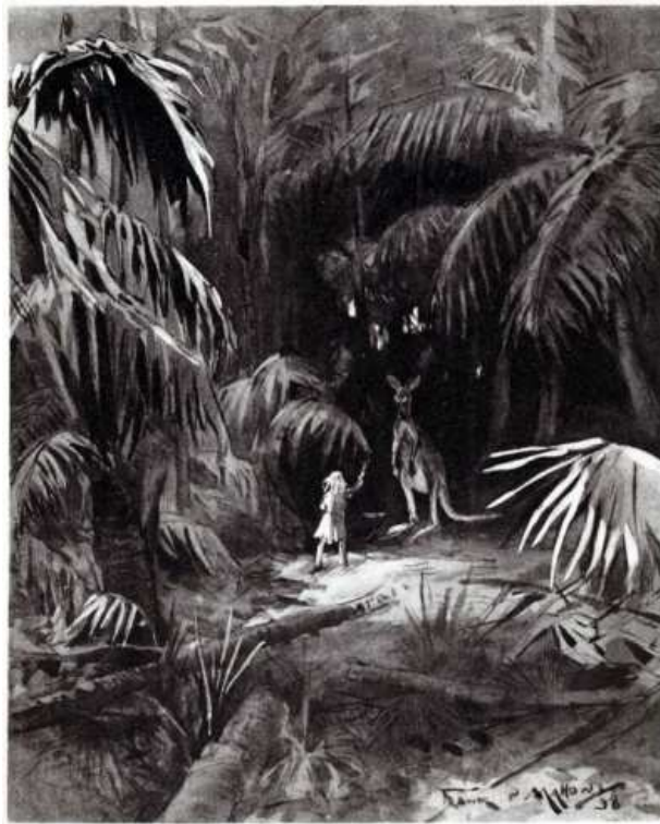
DOT AND THE KANGAROO ON THEIR WAY TO THE PLATYPUS

When they had followed the stream some distance, the gully opened out into bush scrub. The little Parrakeets then said "Good-bye," and flew back to their favourite tree-ferns and bush growth; and the Kangaroo said, that as they were nearing the home of the Platypus, they must not play in the stream any more; to do so might warn the creature of their approach and frighten it. "We shall have to be very careful," she said, "so that the Platypus will neither hear nor smell you. We will therefore walk on the opposite shore, as the wind will then blow away from its home."