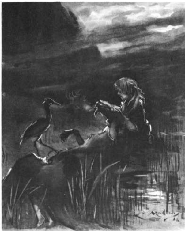
THE BITTERN HELPS DOT

"I escaped then," said the Kangaroo, settling herself on her haunches to tell the tale, "in a way I could have done last night. But I will die sooner than do it again."