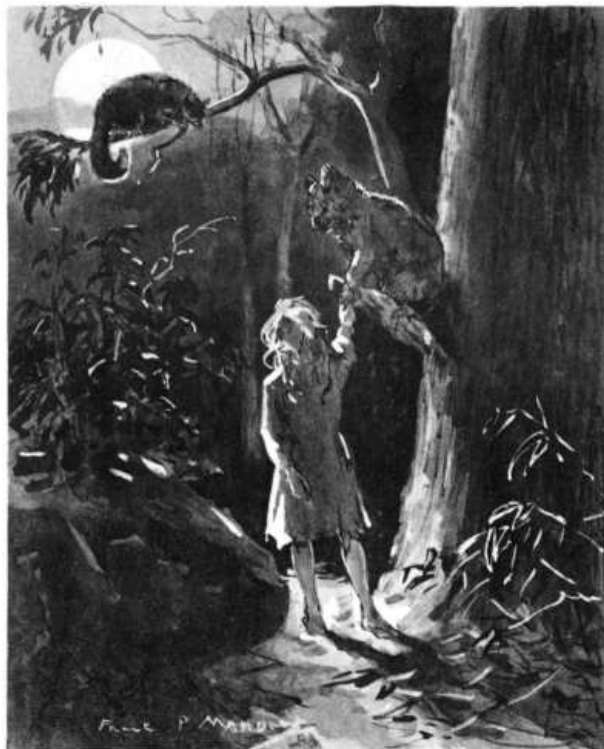
DOT, THE NATIVE BEAR, AND THE OPOSSUM

"They make a dreadful noise with their quarrelling," said Dot. "They are nearly as bad as the Flying Foxes over there. I wonder if they made that fearful sound I heard just before you came?"