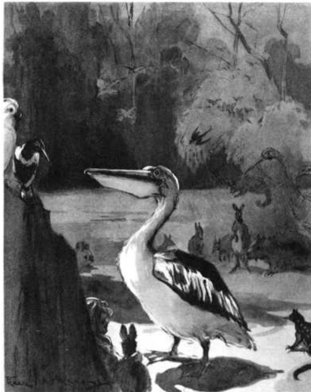
THE PELICAN OPENS THE CASE

As the Swallow spoke, there was a great disturbance amongst the creatures. The swan, ducks, cranes, and waterfowl, besides honeysuckers, and many other birds, were all fanning the air with their wings, and crying, "Turn him out!" "Disgusting!" "I never heard of such a thing in my life! the smell of it always gives me a headache!" and there was such a noise that the jury all woke up, and Dot covered her ears with her hands. The Cockatoo, seeing Dot's distress at the screams and hubbub, and thinking that she wanted to say something, but could not make herself heard in the general riot, decided to speak for her; so he screamed louder than all the rest, and shouted, "Apples, oranges, pears, lemonade, cigarettes, and cigars! I say! what's the row?"