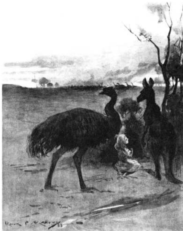
THE EMUS HUNTING THE SHEEP

Dot could see the whole scene well, for beyond a few low shrubs on the opposite side of the sheet of water, there was no sheltering bush near the great tank which had been excavated on the bare plain.