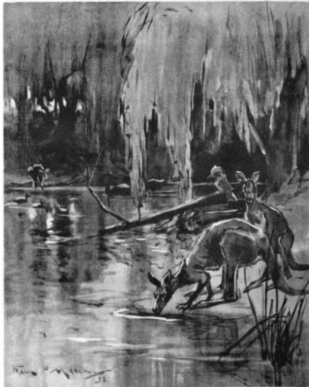
BY THE LAKE (EVENING)

"It seems to me, wife," said Dot's father with a glad laugh, "that the place has become a regular menagerie!"