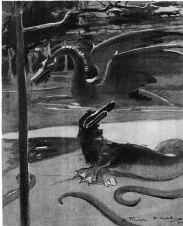
THE PREHISTORIC CREATURES OF THE PLATYPUS'S SONG

"I didn't say a million; I said millions! I can prove by a bone in my body that my ancestors were the Amphitherium, the Amphilestes, the Phascolotherium, and the Stereognathus!" almost shrieked the little creature.