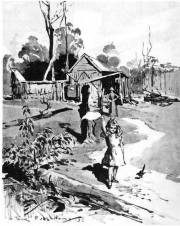
DOT WAVING ADIEU TO THE KANGAROO

Presently the young man, Jack, noticed the little bird. "What friendly little chaps those wagtails are," he said, "and see how tame and fearless this one is. Upon my word, he nearly flew in your face that time!"