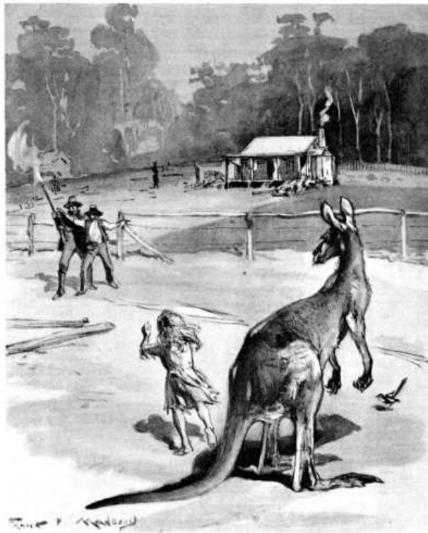
DOT'S FATHER ABOUT TO SHOOT THE KANGAROO

After a supper of berries and grass, Dot and the Kangaroo lay down for the night in a little bower of bushes. But they talked until very late, of how they were to manage to reach Dot's home without danger from guns and dogs. At last, when they tried to sleep, they could not do so on account of Willy Wagtail's singing to his sweetheart, "Sweet pretty creature! Sweet pretty creature!" without stopping, for more than five minutes at a time.