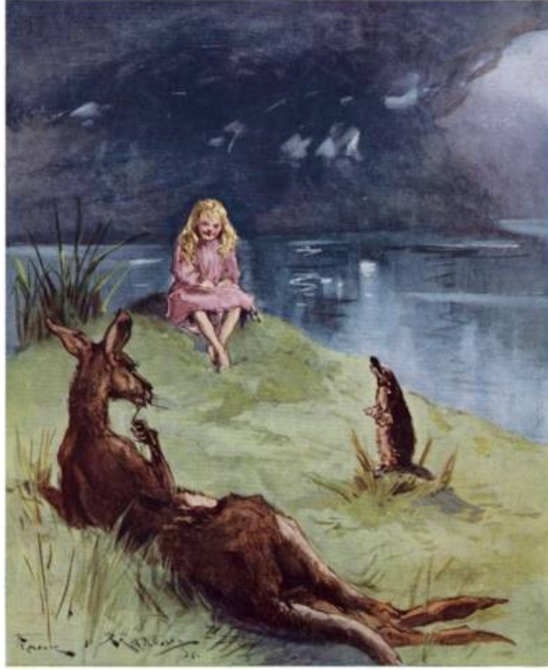
THE PLATYPUS SINGS OF ANTEDILUVIAN DAYS