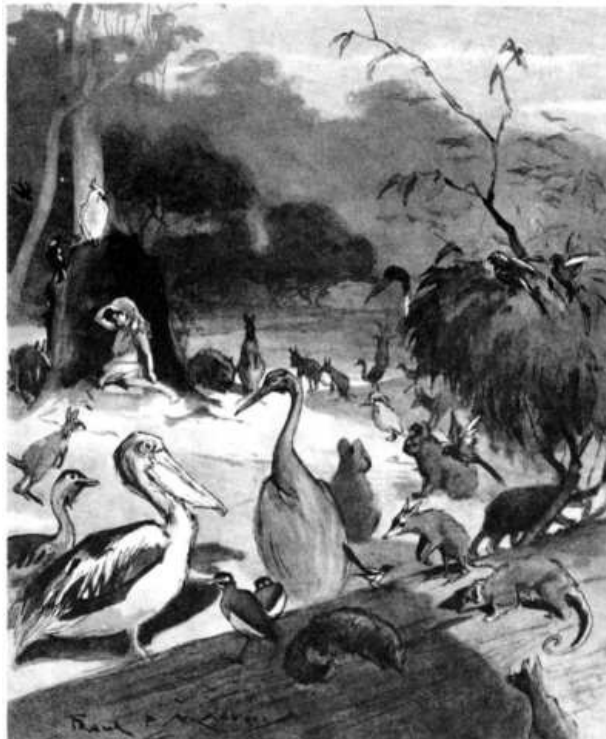
THE COURT OF ANIMALS

"Why are the birds all perching together over there?" asked Dot, pointing to a branch of the dead tree, "since they all hate one another and want to get away. The Galahs have pecked the Butcher Bird twice in five minutes, the Peeweeet keeps quarrelling with the Soldier Bird, and none of them can bear the English Sparrow."