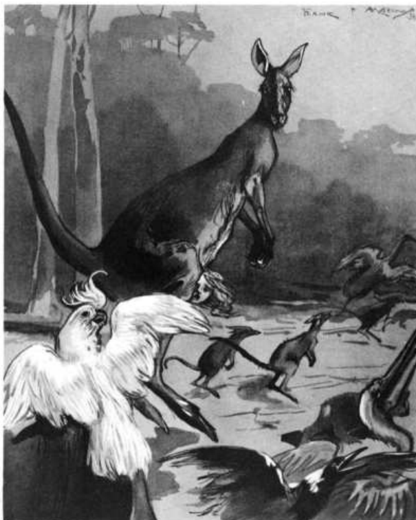
THE KANGAROO CARRIES DOT OUT OF COURT

"That is Willy Wagtail making love," said the Kangaroo, with a humorous twinkle in her quiet eyes. "Peep round the bush," she said to Dot, "and you'll see them spooning."