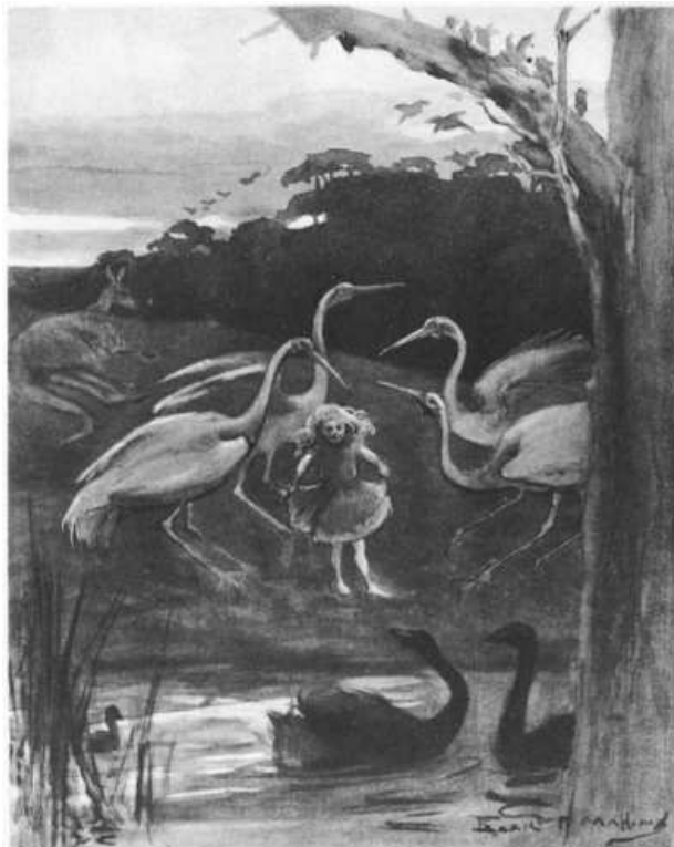
DOT DANCES WITH THE NATIVE COMPANIONS

"That is the beauty of it all," said the Kangaroo. "The Platypus is so learned and so instructive, that no one tries to understand it; it is not expected that anyone should."