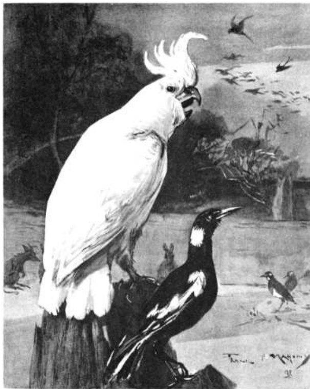
THE COCKATOO JUDGE

This interruption, and the Swallow's repeated assurance that no human trial of importance could take place without horsehair, set all the creatures chattering with astonishment and questions. Some said the Swallow was joking; others said that it was making senseless delays, and that night would fall before they could bring the prisoner to justice. There was much grumbling on all sides, and complaints of hunger, and the jury began to clamour for the grubs that they had been promised, at which the Magpie whispered to Dot that she certainly would be found guilty. The fact was now quite clear to the jury before the trial began.