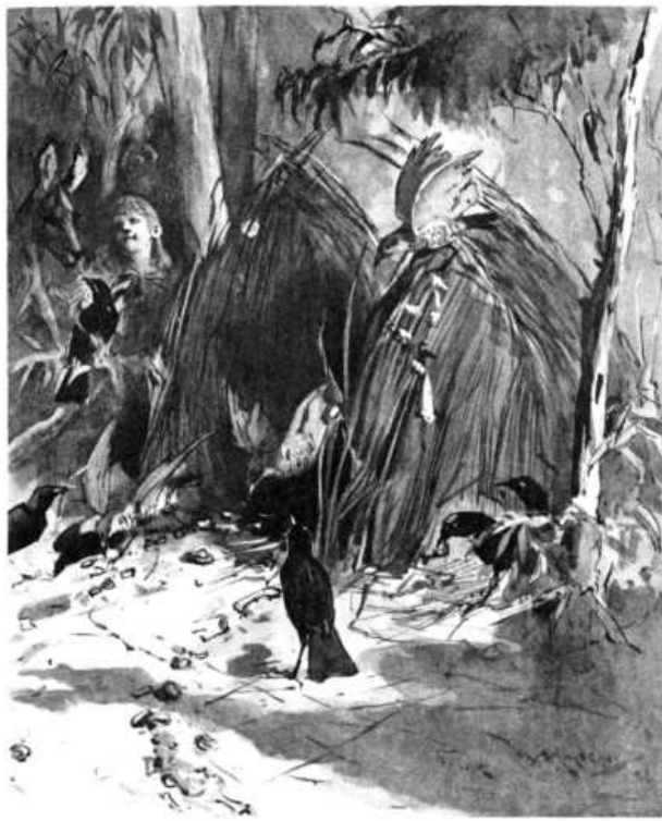
THE BOWER BIRDS

"In my young day," continued the elderly hen, and all the group were sighing, "Ah! in our young days!" when a young hen perched on a bough above them, and interrupted pertly, "Dear me! can't you good birds find anything more interesting to talk about than ancient history?" At this the groups of gossips whispered angrily to one another "Minx!" "Hussy!" "Wild Cat!" etc., and the rude young bird flew back to her companions.