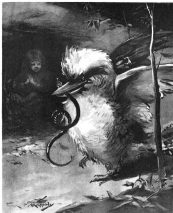
THE FIGHT BETWEEN THE KOOKOOBURRA AND THE SNAKE

But Dot said she would rather wait for the berries the Kangaroo was bringing, so the Kookooburra remarked that if she would excuse it he would like to begin breakfast at once, as the fight had made him hungry. Then Dot saw him hold the reptile on the branch with his foot, whilst he took its tail into his beak, and proceeded to swallow it in a leisurely way. In fact the Kookooburra was so slow that very little of the snake had disappeared when the Kangaroo returned.