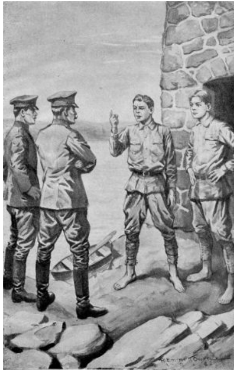
"IT'S FIFTY-FIFTY,—TWO AGAINST TWO," SAID ARCHER.

"When I found you were all right," he said to Archer in his dull way, "and we were all alone here, I might have known it was too good to be true. I wouldn't bother now. I just got bad luck.—When I tried for the pathfinders' badge and tracked somebody that stole something," he added with his stolid disregard for detail, "I found it was my own father, and I didn't claim the badge. That's the kind of luck I got. So I wouldn't try any more. 'Cause if you got bad luck you can't help it. I dropped my knife and the blade stuck in the ground—up at Temple Camp—and that's bad luck. Let 'em come——"